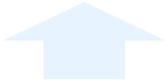
UN-HABITAT RESTRUCTURING ROADMAP (AS OF 13TH AUGUST 2019)