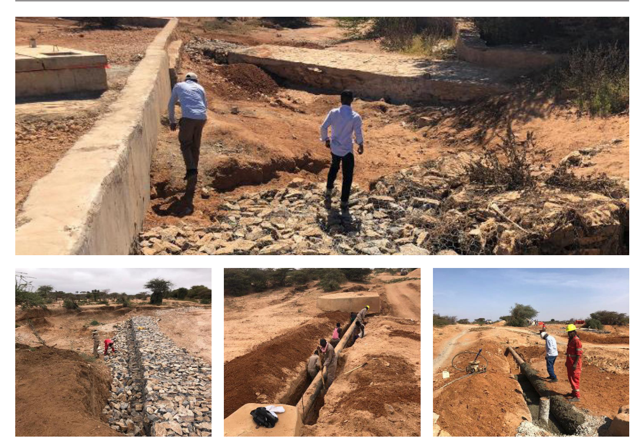
Erosion and flood protection works along critical point of the new pipeline: installation of flood retention walls, gabions, and protection of pipeline sections