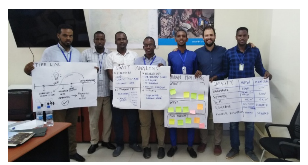
Members of MOPWRH, MoPIED and Baidoa Municipality attending a training

Additionally, the programme delivered a training of trainers on Rapid Urban Profiling and Land Use to the ministry to help replicate the training and build capacity of the municipalities in South West State. Similarly, as part of an effort to strengthen urban planning capacity of ministries of public works of both states, 10 staff members were trained on basic urban planning in the Ethiopian Management Institute which included exposure to urban management practices in Ethiopia and forged peer to peer learning relationship.