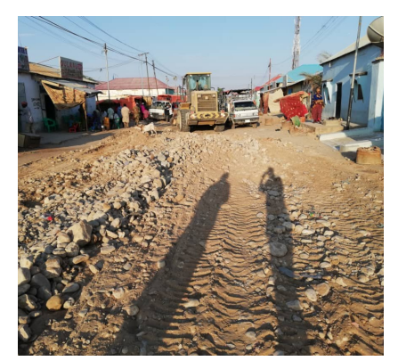
The Minister and the Mayor of Garowe visiting the extension area