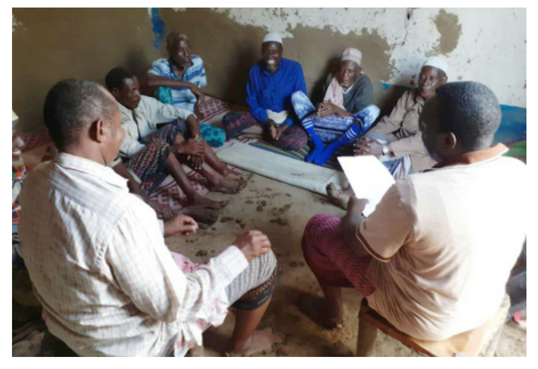
Discussions during the land conflict mapping study

The programme conducted two rounds of ccommunity and state land consultations forums with various state officials and community in 3 different states South West State, Jubaland and Johwar. This was intended to ensure that the perspectives of the communities are captured in the recommendations and frameworks that will be developed and ensure awareness raised for these institutional processes.