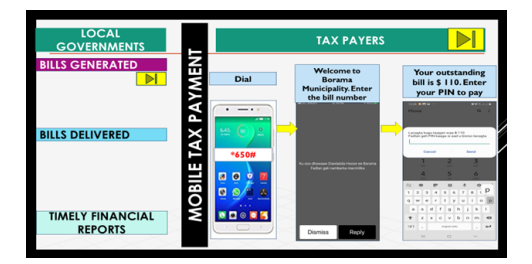
An overview of the installed digital payment platform

In the past years, the Somalia programme has supported the automation of local government financial system. In 2019, the government of Puntland as part of the government-led expansion strategy, extended the automated systems to 2 new districts of Burtinle and Galdogob. Through the JPLG program additional efforts was made in upgrading the existing systems as part of a wider effort to unify financial management systems. This is intended to maximize revenue and subsequently increase service delivery. Conversely, the JPLG program worked closely with relevant government institutions to introduce a mobile money payment system to ease payment of taxes for citizens. This mobile payment approach is now up and running in Borama, Somaliland and Garowe in Puntland.