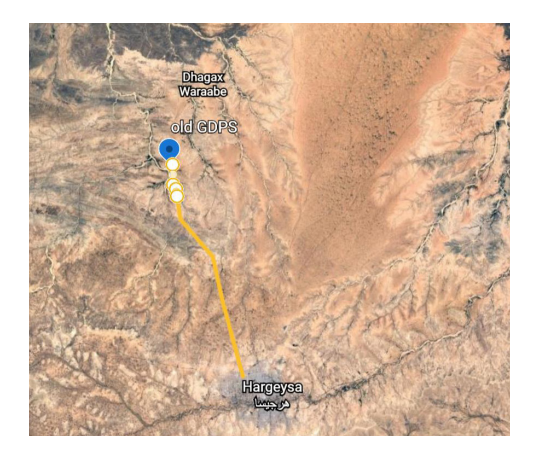
The new 23km long main water pipeline from Hargeisa to Ged Deeble.

In January 2019, SDF started with the construction of the new Wellfield Collector Lot-1. This important intervention, for which UN-Habitat provided the engineering design and the DI pipes, will connect the existing boreholes at Ged Deeble and the new boreholes at Hora Haadley to the new Ged Deeble Pumping Station built by UN-Habitat, thus enhancing the water production capacity.