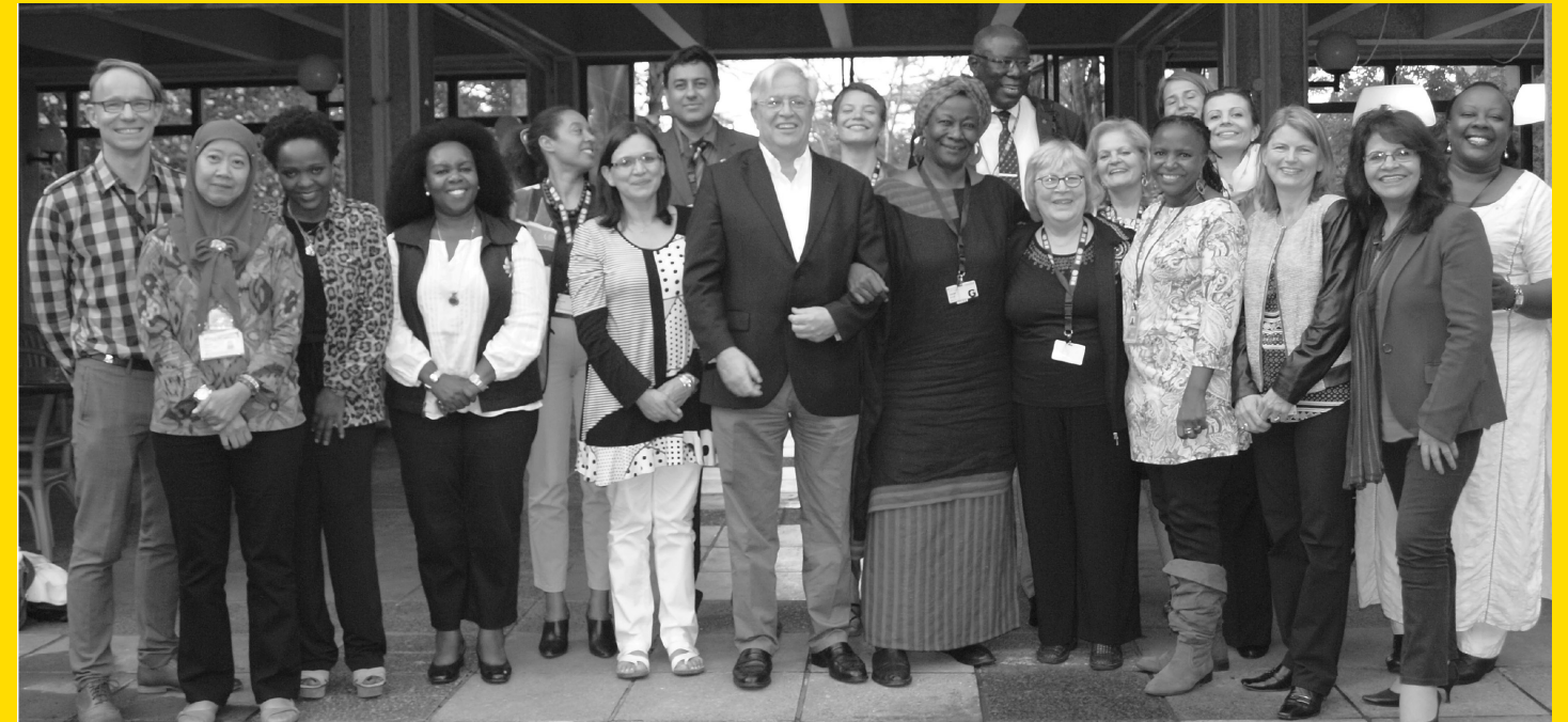
AGGI Annual meeting, April 2015, Nairobi, Kenya