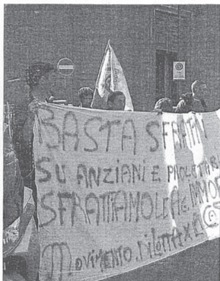
Sfratti sotto i riflettori Sull'emergenza casa c'è un'iniziativa internazionale