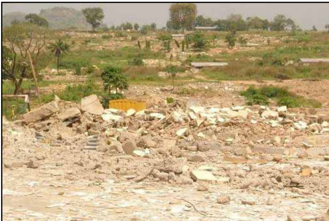
Demolished homes of Kuchigoro settlement, Abuja: November 2006

Since El-Rufai's appointment as Minister of the FCT in 2003, the FCDA has targeted over 49 such settlements in Abuja for demolition, arguing that land was zoned for other purposes under the Master Plan and, in some cases, has already been allocated to private developers. To date, these evictions have affected approximately 800,000 people, as estimated by local organisations. Although the FCDA argues that this number is inflated, they have not released their own figures from their enumerations of the informal settlements.