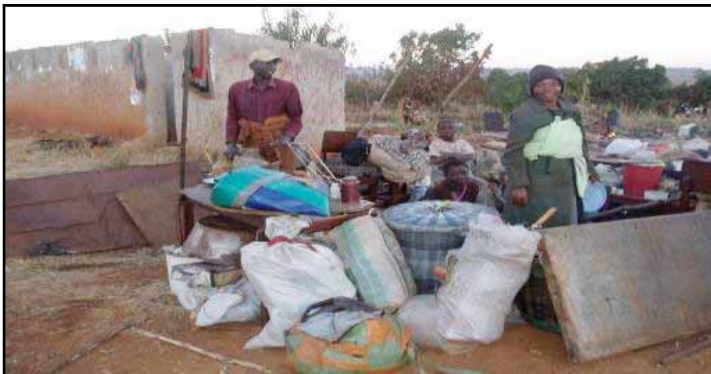
Evictions and Demolitions in Hatcliffe Extension, Zimbabwe

In the wake of Operation Murambatsvina and Zimbabwe's economic crisis, millions of evictees continue to face poverty, malnutrition, starvation and disease. In June 2005, the Government of Zimbabwe launched Operation Garikai/Hlalani Kuhle (Better Life) to provide housing to many of those who lost homes under Operation Murambatsvina. However, over one year after the programme was launched; the Government had built approximately 3,325 houses, to accommodate those left homeless from the destruction of approximately 92,460 structures. At least 20 percent of the houses were earmarked for civil servants, police and soldiers, while some victims of Operation Murambatsvina were provided small plots of land without assistance with which to build homes. Furthermore, many of the homes designated as "built" are not finished, do not have water and sanitation facilities, and have not been allocated. In fact, even if a victim of Operation Murambatsvina was able to access a home through the highly corrupt allocation process, the majority of victims would not be able to afford the homes. 111