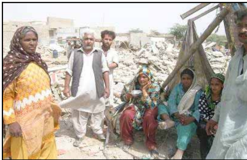
Recent demolitions in Sikander Goth, Pakistan

The communities are being supported by Eviction Watch – Asian Coalition for Housing Rights, and Urban Resource Centre (URC), Karachi