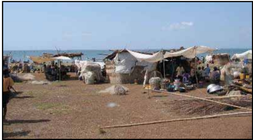
Evictees forced to camp at Mankyere Island, 5 May 2006

The Minister of Ports, Harbour and Railways instituted an inquiry on the boat disaster and presented their findings to the Government of Ghana, which promised to release a white paper on the findings.