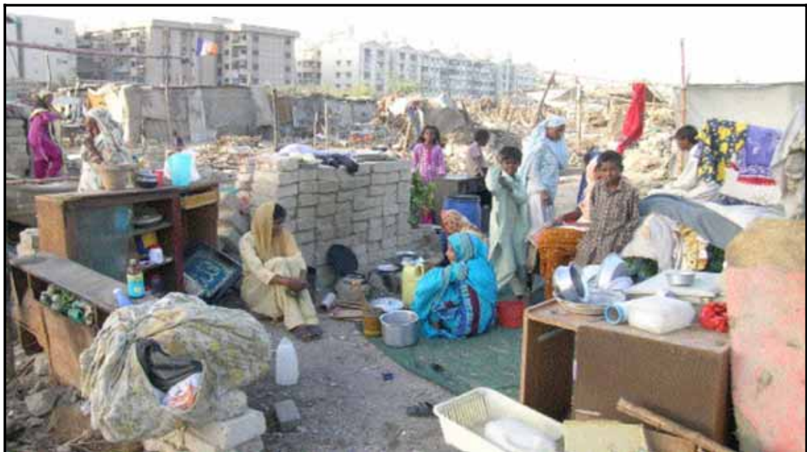
Aftermath of Evictions in Jumma Goth

13 March 2006: Town administration officials demolished 1,250 homes in Jumma Goth — a 30 year old settlement with over 12,000 inhabitants. The affected families lost their household property along with their homes. Police used tear gas and batons when residents tried to resist the demolition of their homes. The local government argued that the settlement was illegal, as it was located on a main water supply pipeline. However, a survey showed that there were various high-rise buildings illegally constructed on the same pipeline, which were not demolished. The operation was started on the directive of the Town Nazim, (Mayor) Gulshan-e-Iqbal, Wasay Jalil. TMO Matanat Ali Khan and TPO Asif Ejaz supervised the operation.