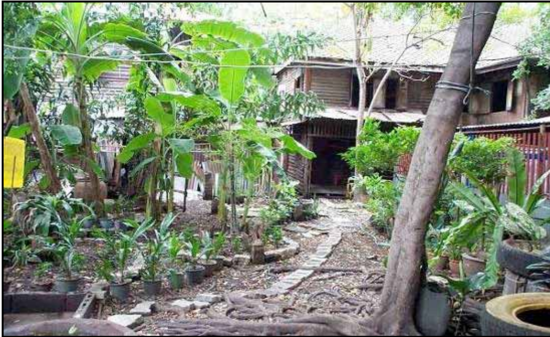
Community demonstration garden: Pom Mahakan, Bangkok

Administration and the University had resulted in an agreement to preserve and develop the area as an 'antique wooden house community'. 43