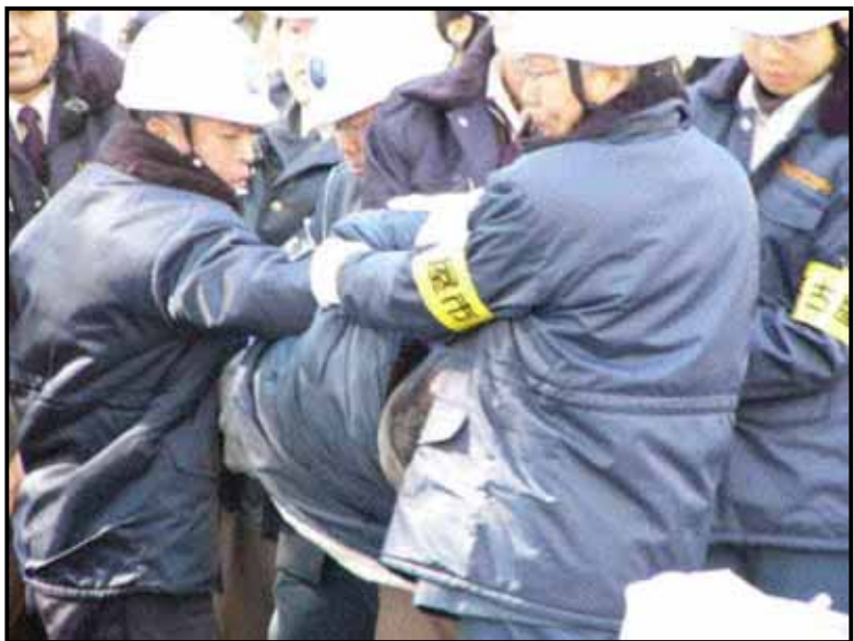
The last person taken from his tent

Hence the Homelessness Law must be viewed as a double-edged sword. Whether the law can be an essential element of enabling policy environment for the poor, depends upon how people organise to protect their housing rights, The first trial in this regard took place just a few weeks after the Law was enacted on 7 August 2002. The City of Ichikawa, adjacent to the east boundary of Tokyo, had issued an eviction notice on 2 August 2002 to about 40 homeless people living beneath the elevated railway. The forced eviction was scheduled for 27 August, and the homeless group submitted an individually-signed letter of protest to the City. The media paid strong attention to the case and a large number of organisations in and outside Japan sent letters of concern to the City. The City Mayor suspended the action.