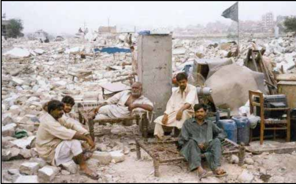
Aftermath of a forced eviction, Lyari Expressway, Karachi, 2002

Forced evictions invariably fail to deliver the outcomes claimed for them by the implementing governments or agencies. In many instances, large-scale evictions are intended as an antidote to uncontrolled and unauthorised urban settlement, in the hope that this will encourage investment and development. However, the causes of rural-urban migration are so varied and deep-seated, the resulting population pressure on cities so overwhelming, that resorting to forced eviction as a solution to illegal settlement amounts to little more than a futile gesture. Evicted individuals, families and communities do not disappear. Nor do they tend to remain for long if relocated to far-flung areas. They tend to find their way back to unoccupied land closer to services and survival opportunities and to resettle and rebuild, as before. In addition, by focussing on the need to get people away from an area, governments often miss the very unique developmental opportunities presented by informal settlements. Properly conceived and implemented settlement upgrading, done in close consultation with the affected parties, has proven itself as a much more effective option in addressing urban development challenges, with great potential benefits for all concerned. 15