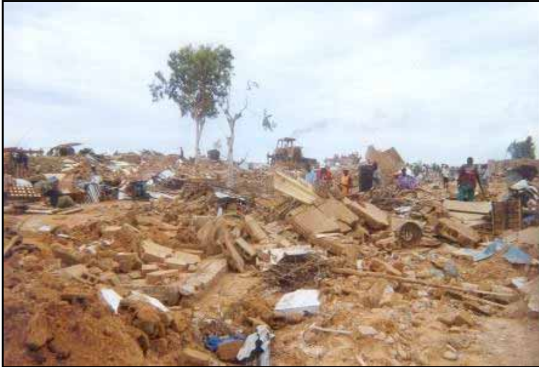
Bulldozer governance: Senegal September 2002

As the outspoken author Wole Soyinka said in protest to the events in Zimbabwe, “Bulldozers have been turned into an instrument of governance and it is the ordinary people who are suffering.” 37 Subsequent evictions in Abuja (Nigeria), Digya Forest (Ghana) and others in Pakistan, Angola, China and elsewhere, seem to indicate that this is indeed the emerging trend.