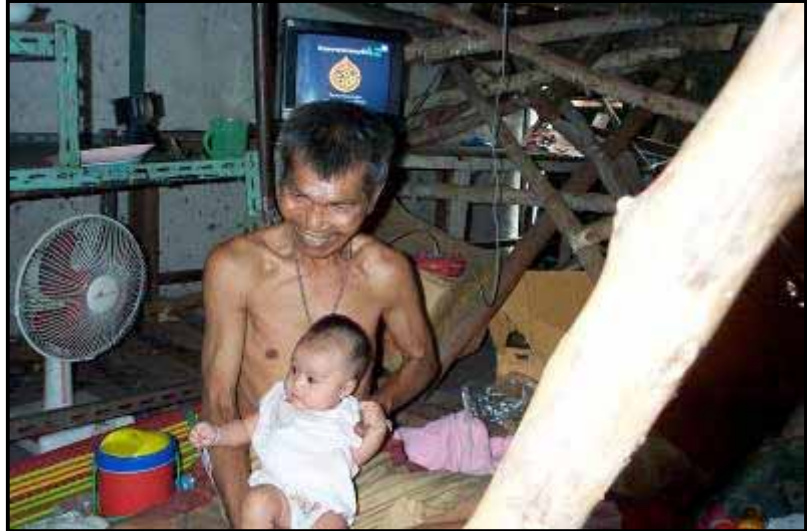
Guarding a barricaded entrance: Pom Mahakan

Pom Mahakan is a community of around 300 residents located next to Mahakan Fort, between the old city wall and the canal in central Bangkok, Thailand. In January 2003, the Bangkok Metropolitan Administration (BMA) served the residents with a notice to vacate their homes. Residents were offered relocation to a place 45 kilometres away, on the outskirts of Bangkok. The proposed relocation was part of the Government-sponsored Rattanakosin Island development plan, to make way for a manicured urban park.