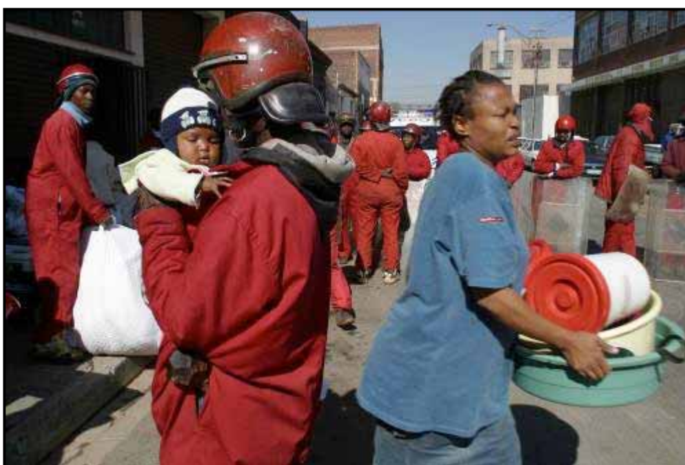
Forced eviction in progress: Johannesburg, 2004

The judgment is a partial victory for the inner city poor. The law is now clear on the point that the inner city poor cannot be evicted without any alternative accommodation. However, the judgement has effectively denied the right of inner city residents to live near their place of work. The judgment appears to condone the City's practice of denying adequate hearings to affected residents before taking decisions to evict, and effectively leaves it to the City to decide if and when the occupiers of "bad" buildings should be consulted prior to future eviction applications." 45