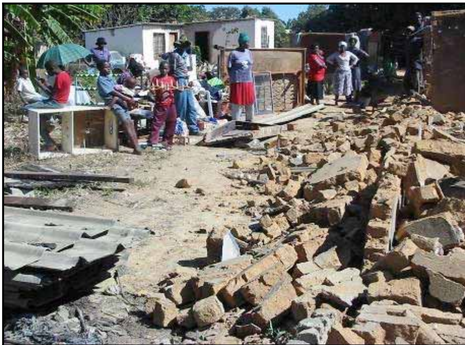
Family demolishing its own house in Epworth, Harare, Zimbabwe

Evictions were carried out without notice or court orders and with disregard for due process and the rule of law. During the forced evictions, police and security forces used excessive force. Reportedly, several children have died during the demolitions. There are also reports that police deterred civil society organisations from providing assistance to those affected. For example, on the night of 26 May 2005 more than 10,000 people were forcibly driven from the informal settlement of Hatcliffe Extension in Harare, where people had been settled by the Government itself. 110