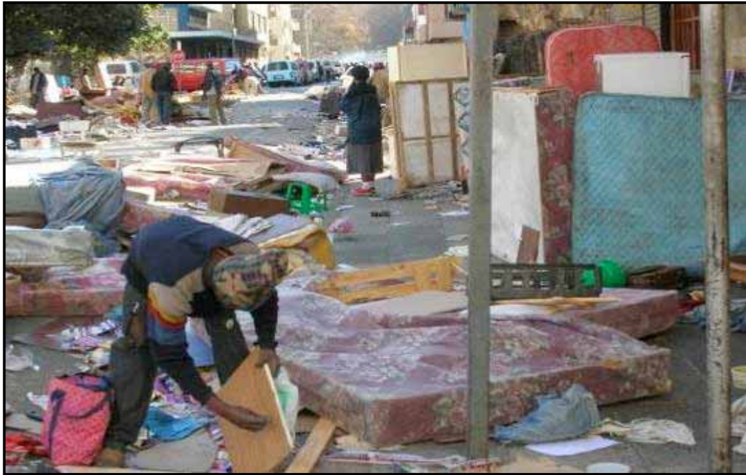
Evicted residents scramble to save and protect their possessions – Bree Street, Johannesburg, 2005