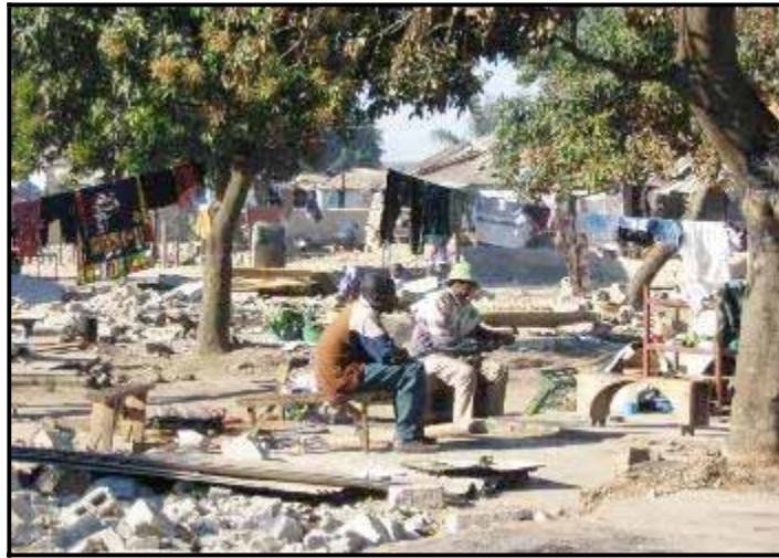
Residents of Mbare living in the rubble after demolitions, Zimbabwe - June 2005

It was within this context that Operation Murambatsvina was officially started on 19 May 2005. President Mugabe initiated this campaign to rid Zimbabwe of what he told Parliament was "a chaotic state of affairs" in the nation's cities and towns.