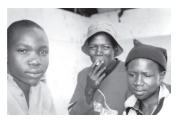
Nairobi, Kenya

Internationally, a number of terms are used to refer to young people. The term youth is often defined as those between the ages of 15 and 24, young people those of 10-24, adolescents 10-19 year-olds, and children, those under 10.6 Countries and regions have many different conventions. In Africa, it is common to define young people as those up to 35 years of age, and to include those under 10. In general, follows the international conventions where data exists, and uses some of these terms interchangeably. It focuses mainly on youth of 15-24.