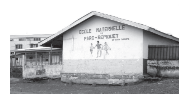
Yaounde, Cameroon: © Laura/UN-HABITAT

day.<sup>28</sup> The main causes of death and stunted growth are malnutrition and disease, both very prevalent in Africa. In Accra, for example, the majority of those under 15 years die from infectious and parasitic diseases. In Egypt, 25% of those under five years have stunted growth, compared to two percent in the USA. Child malnutrition is rapidly shifting from rural to urban areas.<sup>29</sup> The physical hazards for children and youth living in overcrowded slum areas are also high. In Ibadan, Nigeria 1,236 injuries involving 436 children were recorded over a three-month period, and less than 1% were treated in formal health facilities. In Kaduna Nigeria, 92% of children examined had blood lead levels above acceptable limits.<sup>30</sup>