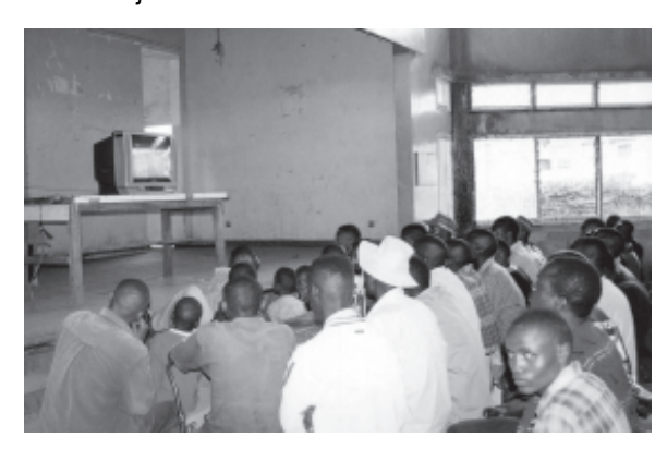
Nairobi, Kenya: © UN-HABITAT

The situation of youth at risk in Africa is acute. While youth in many parts of the world, especially in developing countries, are confronted with severe problems, it is clear that African youth are especially vulnerable. Cities in Africa include some of the world's poorest and most overcrowded urban environments. The lives of young people in Sub Saharan Africa, in particular, are marked by a combination of severe human injustices and disasters.