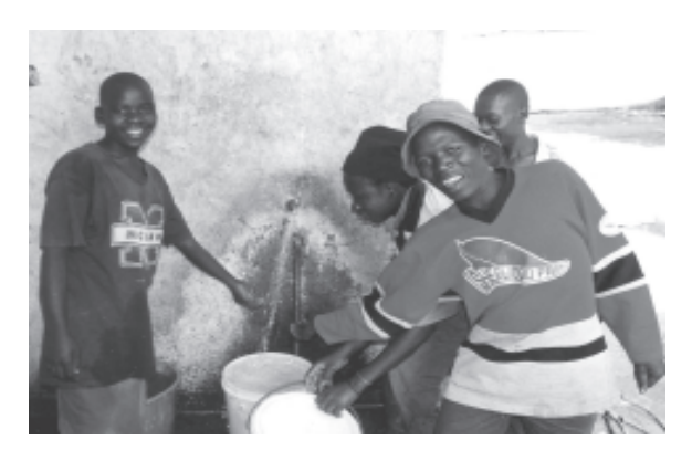
Nairobi, Kenya: © UN-HABITAT

This strategy paper has been developed in the context of UN-Habitat's Safer Cities Programme, and the New Partnership for Africa's Development (NEPAD). It forms part of UN-Habitat's work on urbanization, the inclusive city, the problems of urban youth, and issues of governance and youth participation. It is in keeping with the Millennium Development Goal of achieving a significant improvement in the lives of urban slum dwellers by 2020.