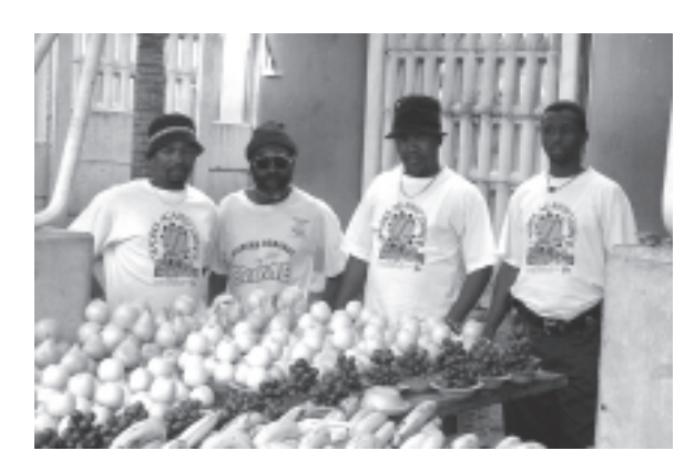
Durban. South africa: © Ismail/UN-HABITAT

A community safety diagnosis helps to identify the locations, neighbourhoods, groups and individuals involved in or affected by specific problems. This can include the use of surveys of victimization and needs. and surveys carried out by youth themselves. The partnership also needs to be involved in the development of a plan of action for tackling the problems identified and deciding on the priorities for action. Each priority action may involve a different set of partners. A substance abuse prevention project may include health officials, drug counsellors, teachers, police, prosecutors, judges, and community organizations specializing in drug rehabilitation, for example, and a programme to address school violence in schools, education administrators, teachers, parent associations, student organizations, social mediators, the police and local businesses. For every problem there will be an appropriate partnership, and the permanent support team helps to guide and coordinate partnership activity. Implementation of the action plan needs to be regularly monitored and evaluated to ensure that the goals and objectives of the plan are being met.