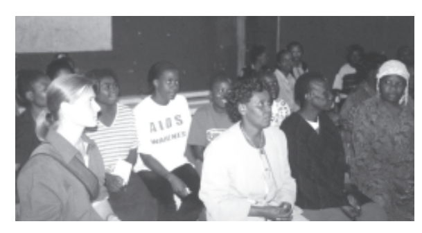
Nairobi, Kenya: © UN-HABITAT

Adolescent girls are at the very highest risk of getting infected. The pattern is especially clear in Sub Saharan Africa.... The danger of infection is highest among the poorest and least powerful. UNICEF (2002) Young People and HIV/AIDS