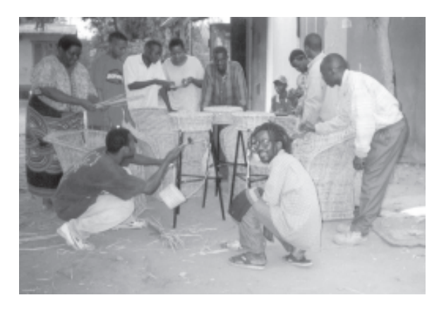
Dar es Salaam. Tanzania

behaviour. The police and the courts are two facets of the criminal justice system which can play a major role in reducing the marginalisation of youth at risk, as well as in their rehabilitation. A corrupt or inefficient police and justice system encourages calls for tough responses and vigilante justice, and affects the extent to which youth at risk trust state institutions, and can be expected to abide by laws and policies.