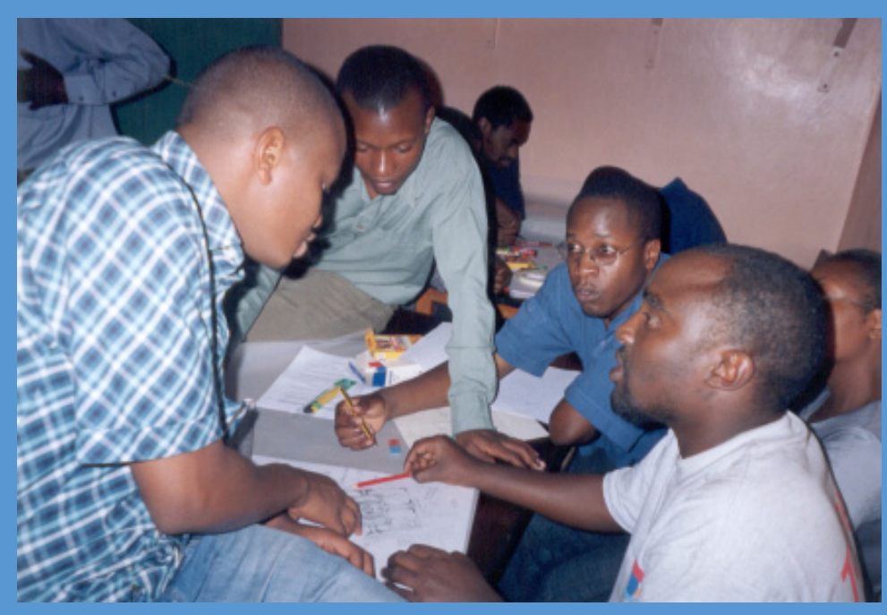
Nairobi, Kenya: © UN-HABITAT