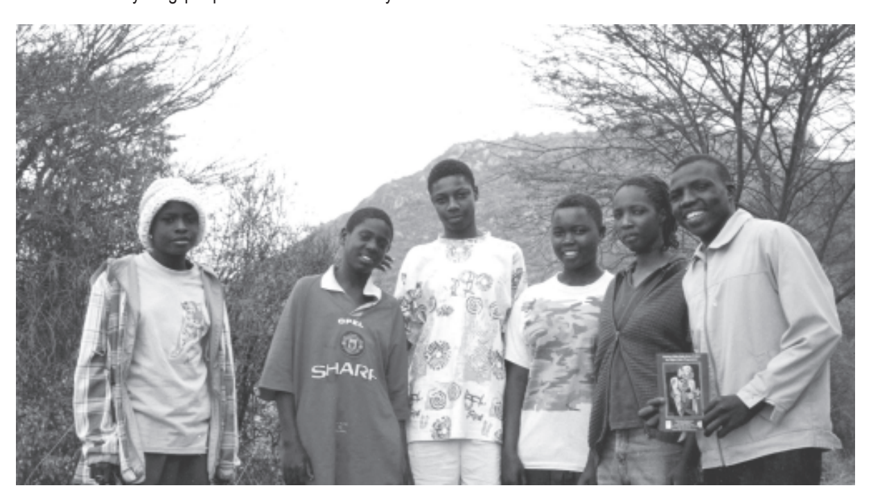
Nairobi, Kenya

This section has outlined the challenges facing youth in African cities. The specific case of youth at risk is discussed in the next section