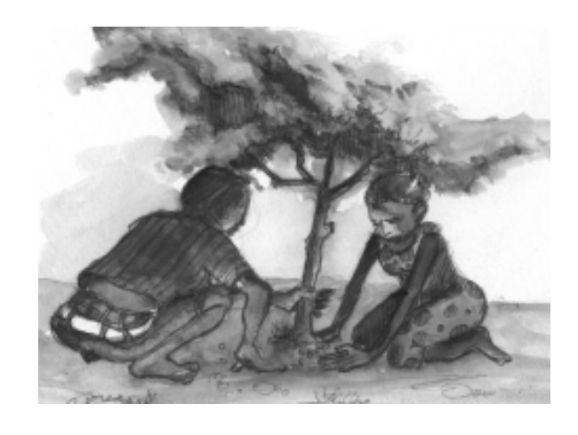
Nairobi, Kenya

With their exposure to the extremes of violence often reported, child soldiers are likely to suffer very serious physical, psychological and sexual harm. Overcoming the effects of those experiences, as well as dislocation from families and communities of origin, and loss of traditional education and socialization, and integrating back into the community, presents huge challenges. Governments who fail to acknowledge the participation of children as fighters, and exclude them from benefits have not always recognized their needs. Many other children and youth have also been affected by the impact of war on their families and communities, and the destruction and dislocation which has resulted.