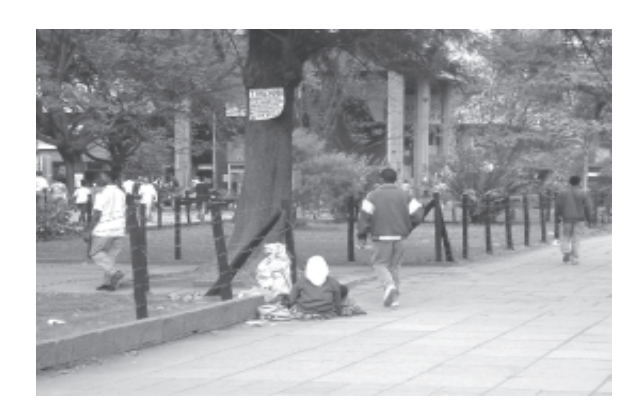
Nairobi, Kenya: © Jimmy Shamoon/UN-HABITAT