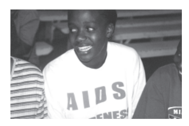
Nairobi, Kenya: © UN-HABITAT

UNICEF 2002 Young People and HIV/AIDS: Opportunity in Crisis