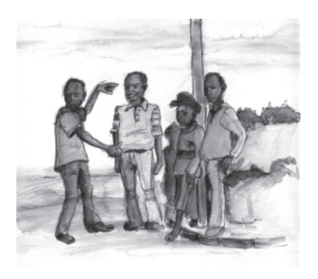
Nairobi, Kenya: © Kanyua/UN-HABITAT

Gangs and groups of young people engaging in delinquent or criminal behaviour are found in most countries. The great majority are male, and in most cases they are in a transition stage. Their formation is often a reaction to exclusion and marginalization in society, and they serve to provide alternative legitimacy and support. They offer acceptance, status, identity and social and recreational opportunities, as well as economic gain. They range from lose social or friendship groups - youths who hangout together - to more organized and structured gangs engaging in unlawful acts such as 'taxing', fighting rival groups, drug dealing or violent crime and intimidation. The latter often have a common style of dress, codes of conduct and language. Gangs of street children, on the other hand, are rather different, since their primary aim is survival, not crime.