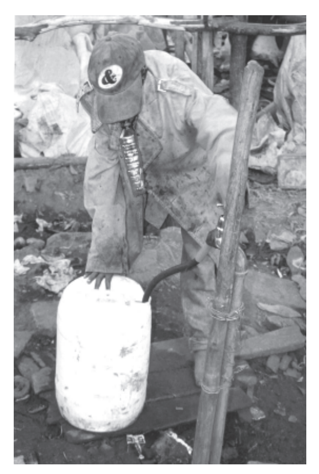
Nairobi, Kenya: © Justo/UN-HABITAT

of a formal education.<sup>41</sup> Child labour also increases the risks of exposure to illegal activities such as prostitution or drug trafficking, and increases the risk of AIDS especially among girls. Finally, close family ties are essential for children, but child labour often inhibits regular contact with family members, because of distances and transport costs. Coupled with exploitative working conditions, these problems can transform child workers into street children.