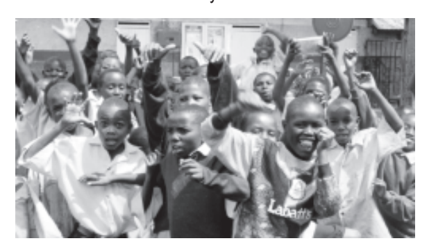
Nairobi, Kenya: © Sabine/ UN-HABITAT

Many of those living in informal settlements do not even enter primary education, because families cannot afford it, or lack of schools. Others never progress beyond primary level, again for reasons of cost as well as the availability of secondary education. Yet others leave school early, under pressure from families to earn money or provide family care. This increases their vulnerability to crime and victimization, and further reduces their opportunities to find productive work and involvement in their society.