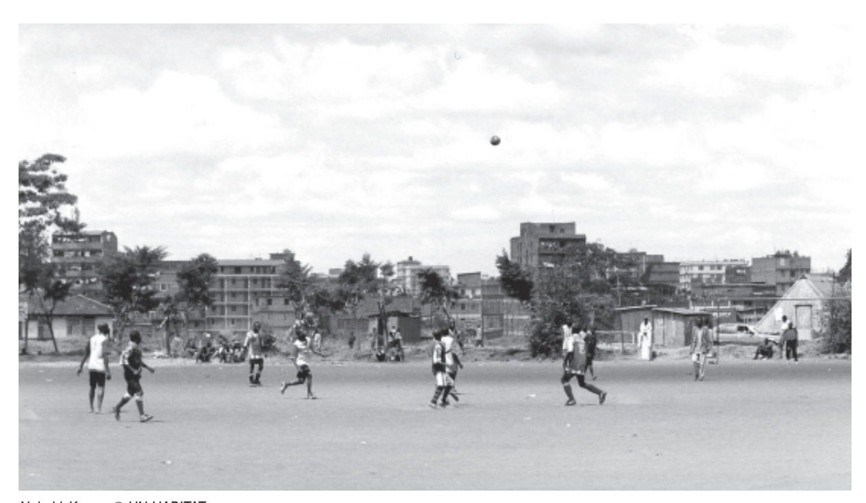
Nairobi, Kenya: © UN-HABITAT

This section has outlined the ways in which local governments in a number of countries in Africa have begun to meet the challenges of urban youth at risk, have been successful in working in a strategic way, and developing integrated comprehensive partnerships across municipal institutions and with civil society. The following section looks at the role of the international community.