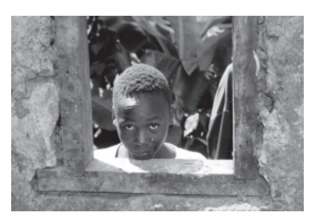
Nairobi, Kenya: © Justo/UN-HABITAT

The behaviour of young people in many African cities often fluctuates between survival strategies and risk taking. The Street children - those with disrupted or no family ties, who survive in urban areas on the streets form the most tragic and extreme examples of social exclusion, and risky behaviour. They are one of the fastest growing problems in Africa (as well as other