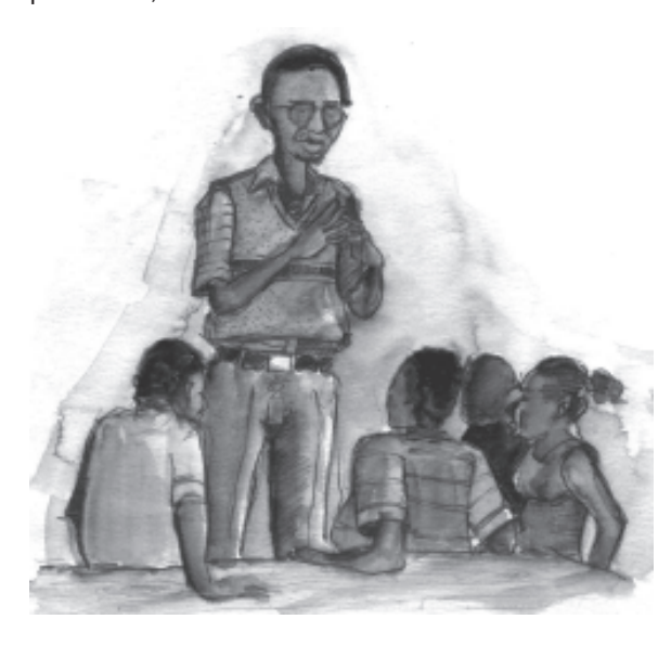
Nairobi, Kenya

youth - young people whose background places them 'at risk' of future offending and victimisation. There is already a huge increase in youth crime and deviance among young people in the region. The concern here is with the serious impact of recent global and regional trends on the most vulnerable young people and the communities in which they live, and on their capacity to participate in their own societies and be included, productive, and fulfilled citizens.