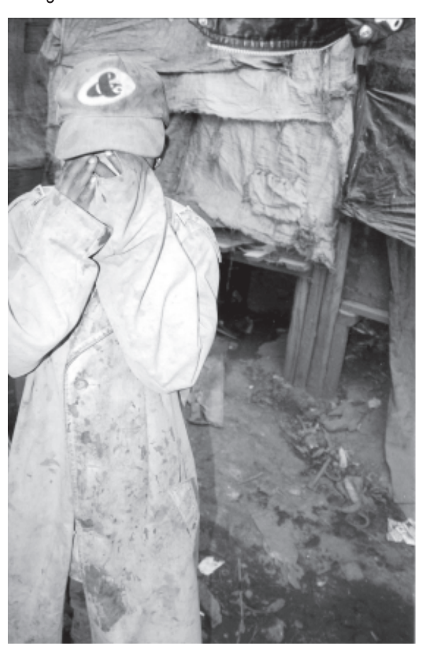
Nairobi, Kenya: © Justo/ UN-HABITAT

aged 15 to 24.<sup>47</sup> Every day, about 1,700 children become infected with HIV. There are an estimated 2.1 million children worldwide under age 15 currently living with HIV. In 2003, about 630,000 children under the age of 15 became infected.<sup>48</sup> About 1.7 million new