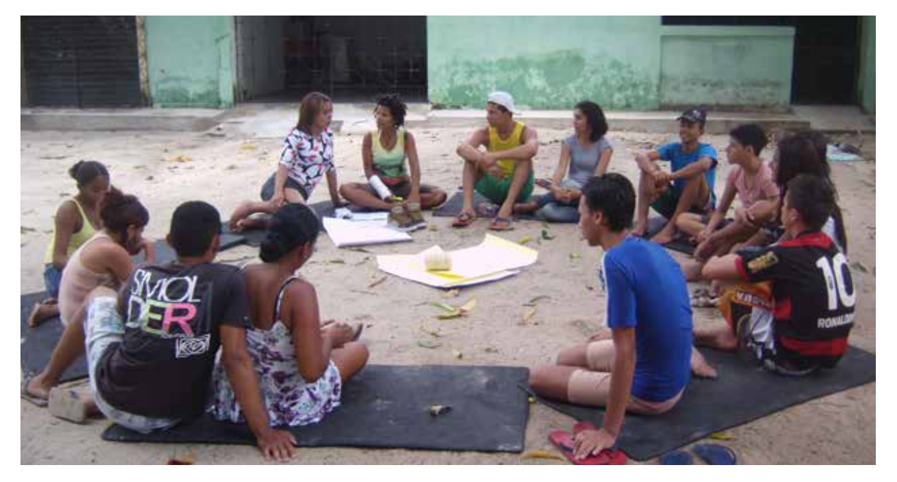
A group of young people participating in a UN-Habitat Youth funded project to promote youth particaption in the construction of public policies for youth in Brazil, 2012