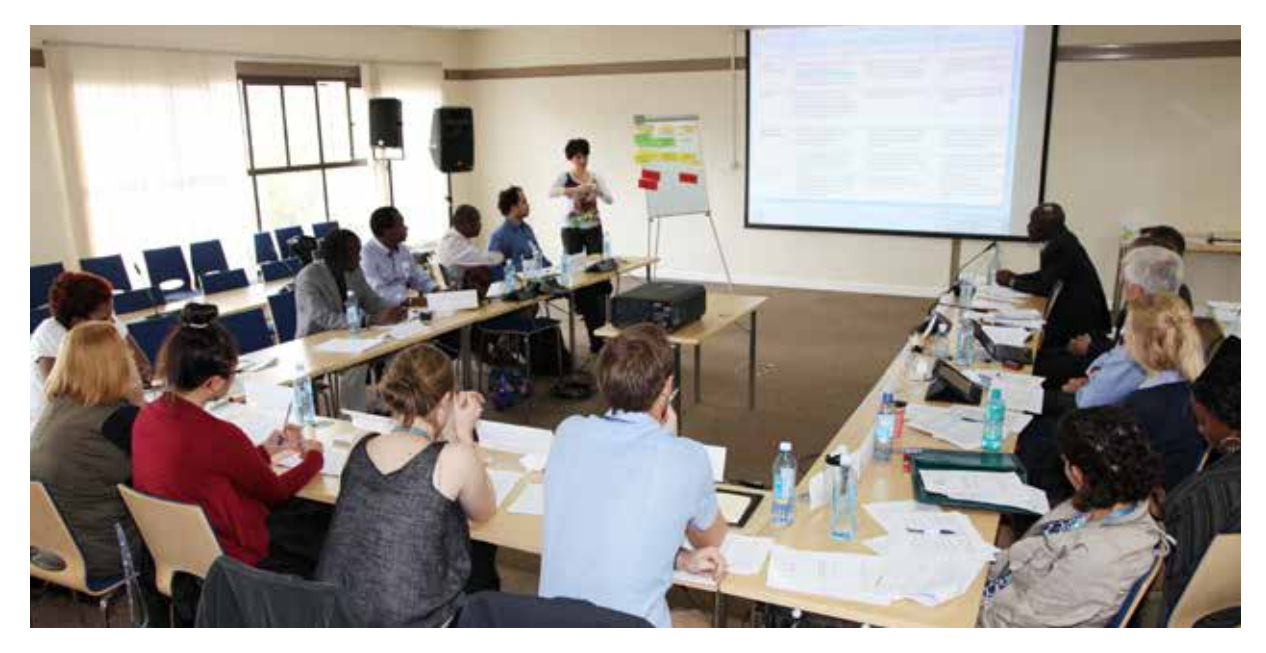
Results Based Management Training for the staff development of the results framework and performance measurement plan for Strategic Plan held in Nairobi, Kenya 2012

coordination and cooperation barriers. While MTSIP facilitated increased internal coherence, it did not succeed in breaking down the 'silo mentality' completely. The 'silo mentality' could be a result of a combination of UN-Habitat's current organizational set-up and the attitude of some staff members. The current restructuring is anticipated to negate this and create a mind-set that will be more conducive to addressing strategic and institutional challenges. The continued reform process may eventually, in the medium to long-term, succeed in achieving a higher degree of coherence and efficiency in obtaining results and make these more sustainable. Currently, the organizational environment is still in need of improvements.