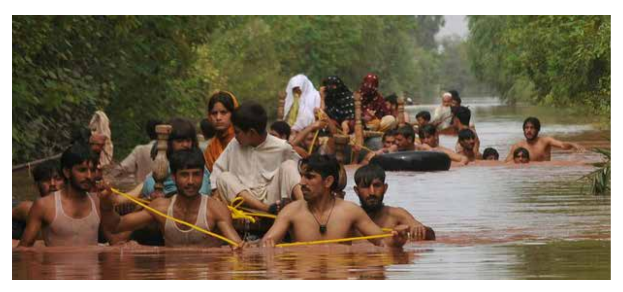
Residents of Khyber Pakhtunkhwa District in Pakistan have a boat ride to safer grounds after floods, 2010. UN-Habitat facilitates reconstruction after natural and man-made disasters.