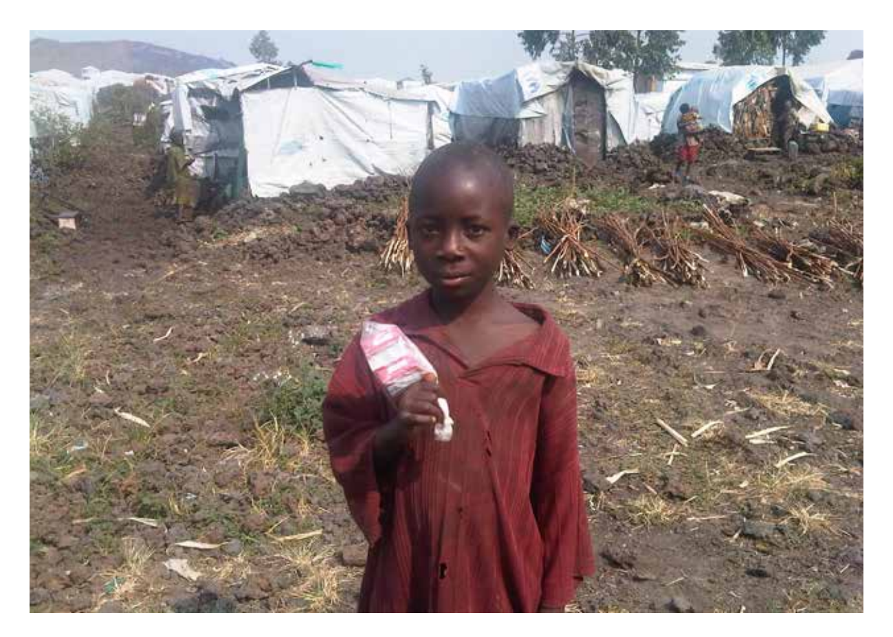
Child outside an IDP camp in the outskirts of Goma, DRC where UN-Habitat/GLTN is implementing a land programme on conflict mediation, 2012.