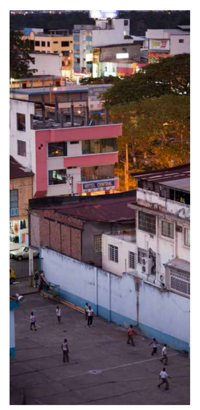
Children playing in the school yard in the centre of Esmeraldas, Ecuador. 2010. UN-Habitat is supporting cities in developing and least-developed countries, develop inclusive urban planning policies, including promotion of public spaces.

UN-Habitat works in post-conflict and disaster-affected countries and addresses specifically the needs of small- and medium-sized cities, towns and settlements. The work with urban-rural linkages and urbanization, with a regional perspective, is expected to intensify. In each of the continents, the Sustainable Urban Development Network (SUD-Net) will be utilized to identify partners. The work will involve the private sector, NGOs, and community-based organizations.