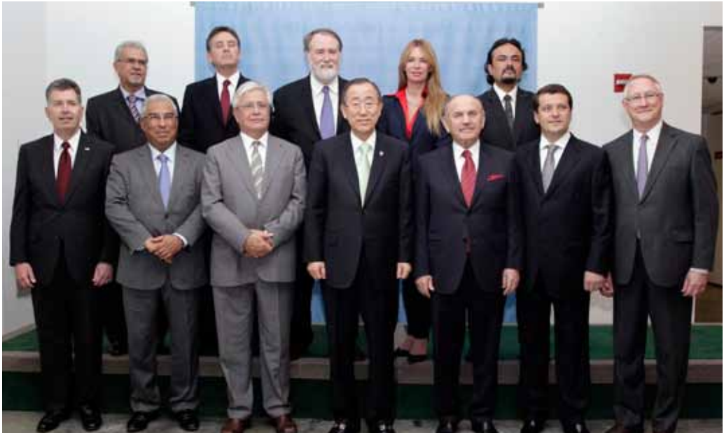
Secretary-General Ban Ki-moon (front, centre) and Executive Director, UN-Habitat, Joan Clos with mayors and regional authorities on sustainable development and the UN Rio+20 Conference at United Nations Headquarters in New York. The meeting was organized by UN-Habitat, 2012

port partnerships such as the Earth Institute at Columbia University and feeds directly into projects on land, legislation and governance, as well as research and capacity-building projects.