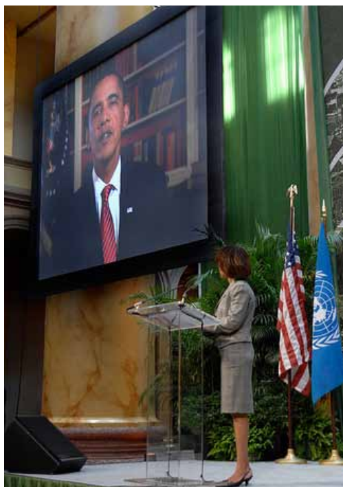
Director Domestic Policy Council, United States of America and Co-Chair, World Habitat Day Honorary Committee Ms. Melody Barnes during a video message delivered by President Obama at the 2009 World Habitat day Opening Ceremony held in Washington, D.C.

Partnerships: The office has forged partnerships with various departments, organizations and institutions including the World Bank, Cities Alliance, the Inter-American Development Bank, the Rockefeller Foundation, the Ford Foundation, the William J. Clinton Foundation, the Global Environ-