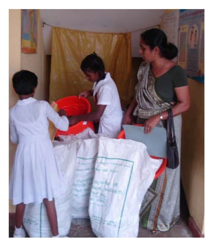
Children - Change agents for solid waste management.

today, but both are enthusiastic about the future of the Forum. The spadework for this initiative started in middle of 2006 when the project team, including the National Forum of People's Organization field workers, visited the Kaldemulla temple and called a meeting of the residents of the neighbourhood which the two men attended. Kaldemulla which has a population of about 6,000 and falls in the Morutawa municipality had community based organisations even before the project started. But with floods being a recurring problem, five (5) community-based organizations came together and formed a Federation of community-based organizations, Kaldemulla community-based organizations, to press for action against its ravages. The Kaldemulla communitybased organization members were keenly watching the work by the Lunawa Project but till mid-2006, the project had been dealing only with the project affected persons. However during that meeting at the temple, when the project team made a multimedia presentation, the Kaldemulla community members