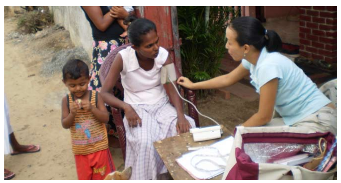
Japanese volunteer's involvement in social development.