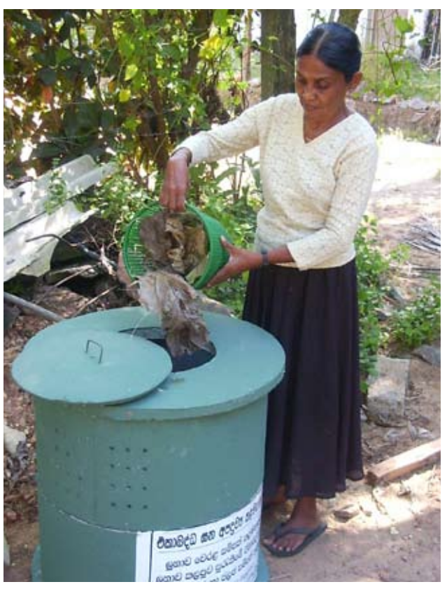
Composting - home-base solution for solid waste management.

Generally speaking about flood control projects, solid waste management is a crucial issue. If people living along the canals throw garbage into rehabilitated canals, the canals get polluted and stagnated, and the project benefits decrease. Before the implementation of the Lunawa Project, the waste was dumped on the wayside in the catchment area. Municipal workers were supposed to collect it from there. But that system was not functioning smoothly and as the population increased, uncollected garbage was strewn around. The Municipal Council was also handicapped due