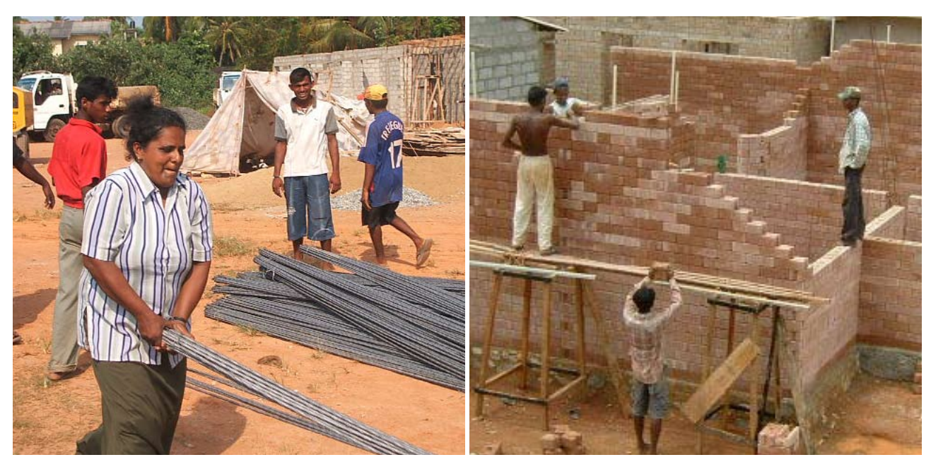
Bulk-purchasing by community for home building.