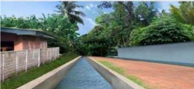
Canal bank before and after the resettlement.