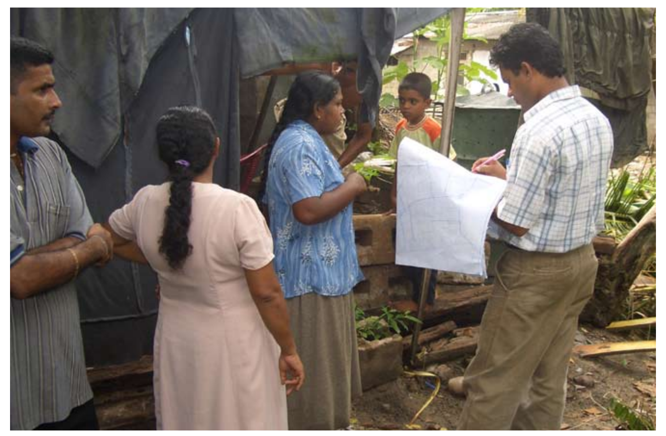
Dialogue with people through NGO staff.

The one NGO which served as conduit to the communities was the National Forum of People's Organization with grassroots experience in community mobilization. The National Forum of People's Organization was primarily responsible for social preparation, mobilization/motivation and institutional building among the target communities to ensure their fullest participation in the planning, implementation, operation and management activities of the resettlement component of the project.