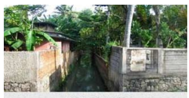
Raja Mawatha - NI

The successes on the ground have led to other institutions and projects tapping the Lunawa toolkit of good practices, and adapting specific ones, for their own benefit. The most important lesson from this path-breaking project is that investing time and resources in the preparatory phase pays, and it is helpful to have NGO partners who can act as strong links between the urban poor and the project team as well as with local authorities, and help build a cordial working relationship. This can be leveraged later for other development objectives.