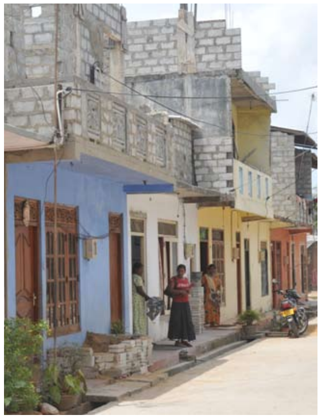
Beyond conventional resettlement - opportunities for improvement.

out land for those who opted to construct houses in the project-selected resettlement sites, obtaining the necessary approvals from the local authorities, assisting project affected communities to design their own houses and equipping them with skills to supervise the construction work.