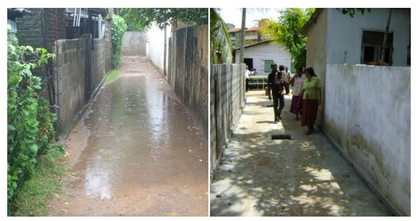
Flooded settlement before upgrading.