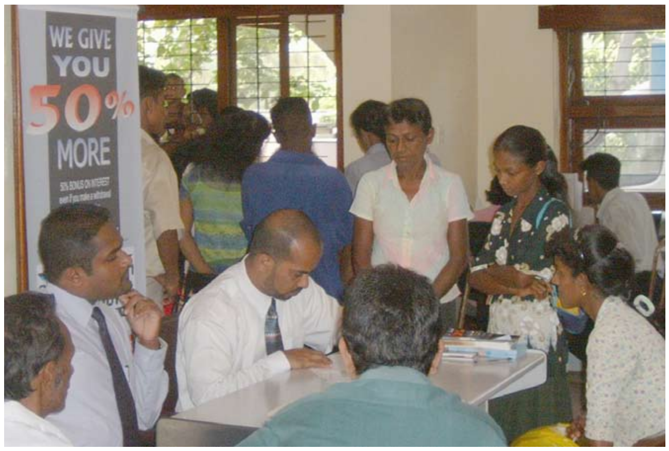
Linking affected urban poor with the formal banking sector.

signed between project affected persons, banks and the project helped to ensure that the entitlement money was utilized in a methodical manner. Once the houses were built and the whole family resettled in, project affected persons were able to use the balance money in the bank, if available, for any activities including income generation. In addition, under the MOU, bank accounts were opened in the name of the husband and wife jointly as a social safeguard.