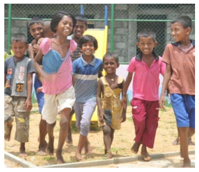
Children's park - inclusive resettlement planning.

In the past experiences of resettlement, community feedback was not incorporated into the design of the resettlement site plan. In the case of the Lunawa Project, however, attempts have been made to put project affected persons in the centre of resettlement site development. A Community Development