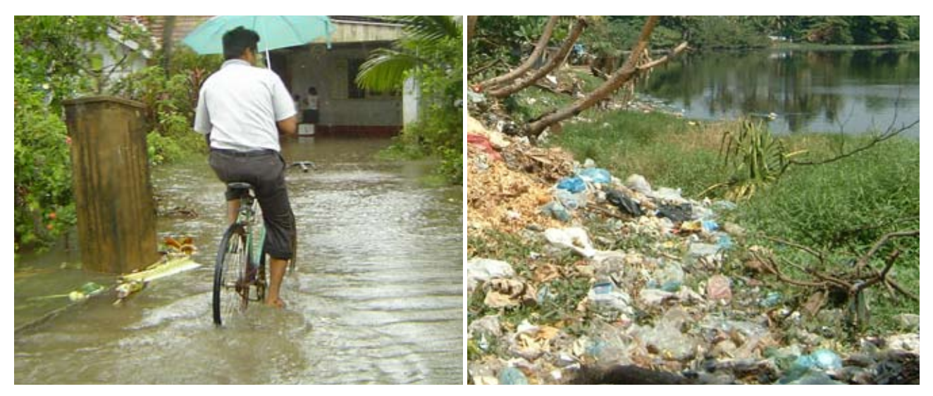
Living with flood.

The lake and the surrounding area have been environmentally degraded due to a combination of