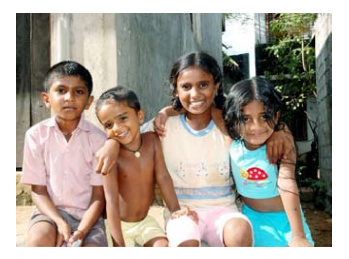
We create better future.

The project's considerable accomplishments are the outcomes of the innovative partnerships that were forged during the preparatory and implementation phase. A key element was the adaptability of the political leadership in the country and those at the helm of key ministries who saw the merit in the arguments underlining the Lunawa approach. To replicate the project's success elsewhere, therefore, the prerequisites are political will and strategic alliances. No one agency alone could have accomplished what the Lunawa Project did. But together, pooling the resources and strengths of all the stakeholders, it was possible to operationalise the policies into good practices that can be replicated in Sri Lanka and other developing countries upgrading their infrastructure.