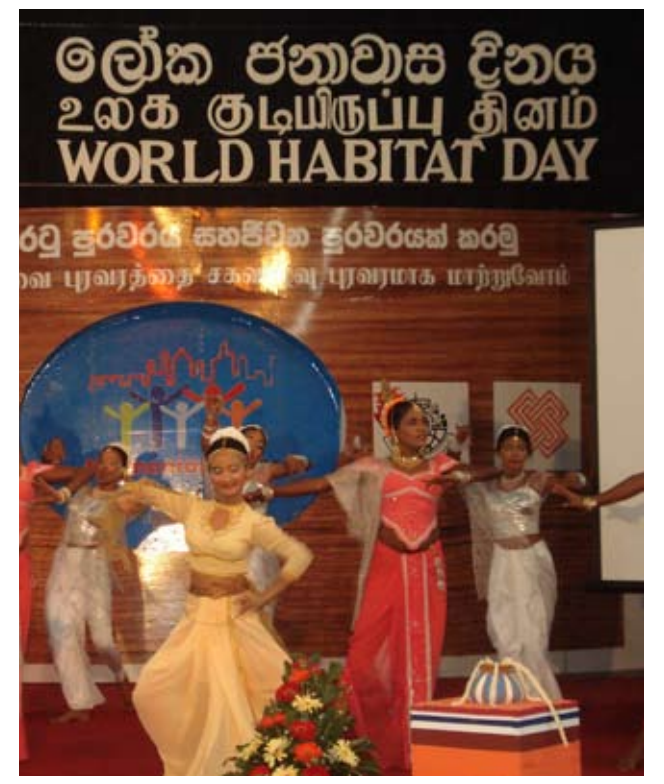
World Habitat Day ceremony in the project area.

Another option of resettlement is to settle in lands purchased by project affected persons themselves, so-called self-relocation. Traditionally, governmentbacked initiatives offered project affected persons no or few options about where they resettled. The Lunawa Project took the initiative to implement a participatory approach, working with the project affected persons, and offering them choices in the sites they constructed their new homes and in the building technologies they used. The project affected persons were told that if they chose to resettle in one of the four official resettlement sites, which had all the facilities, they would be given 50 sq m of land. On the other hand, if