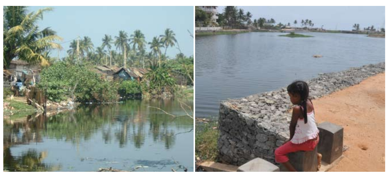
Pulluted lake with illegal encroachment.