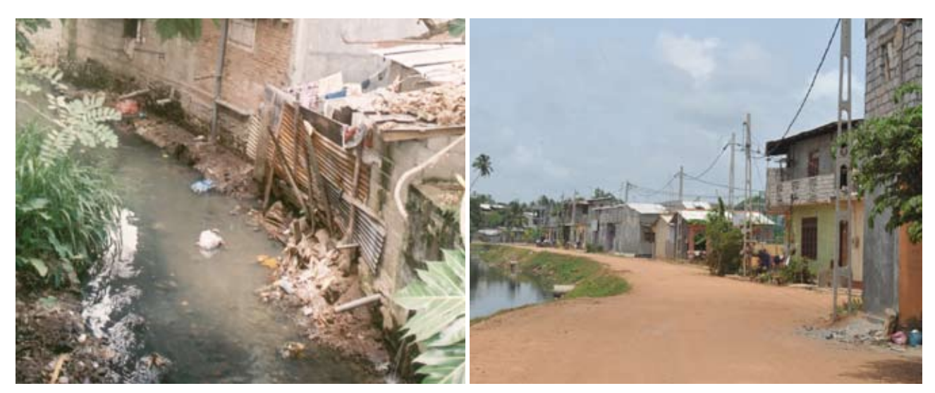
Backyard polluted canal.