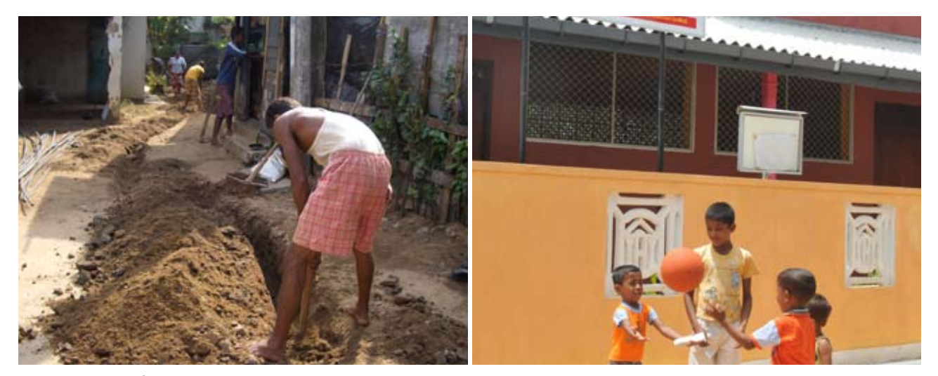
Settlement infrastructure improvement through community contracting.

Committee (CDC) developed a Community Action Plan, where necessary infrastructure and other issues in the resettlement site are identified. To implement the infrastructure development, a CDC entered into 'community contracts' with the project. Under a community contract, project affected persons were responsible for construction, while technical inputs were provided by the project technical staff and local authority staff.