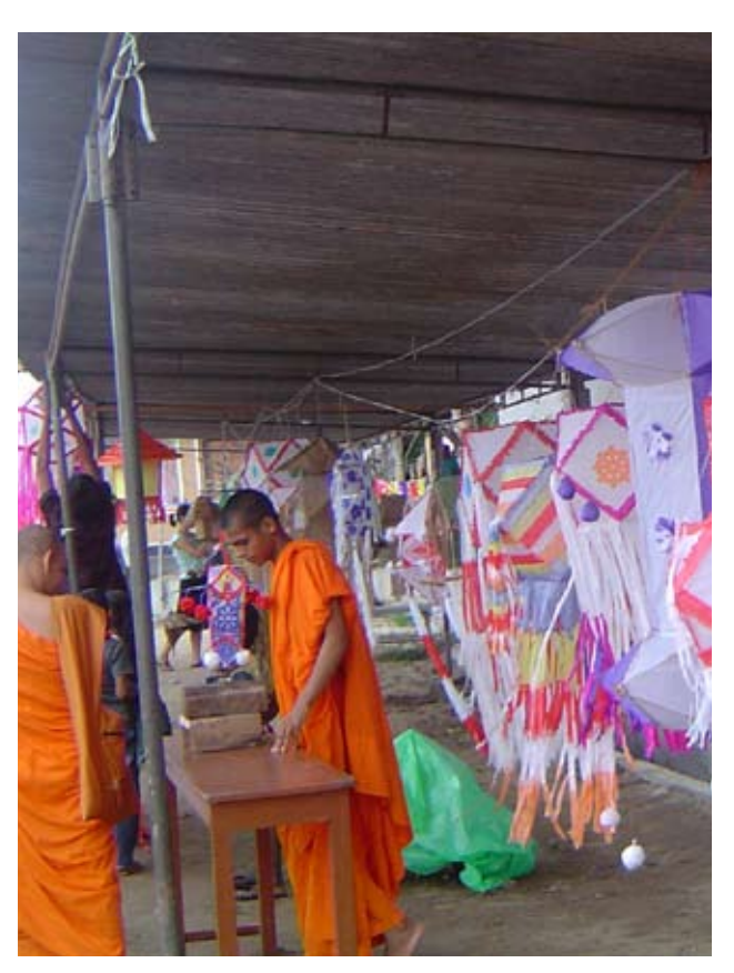
Lantern Festival - religious harmony with host communities.

In addition to the above, a diverse array of approaches and tools were developed and used in the resettlement process of the project, which will be explained step by step in Chapter 3, followed by Chapter 4 which describes the initiatives taken by the project other than 'resettlement'.