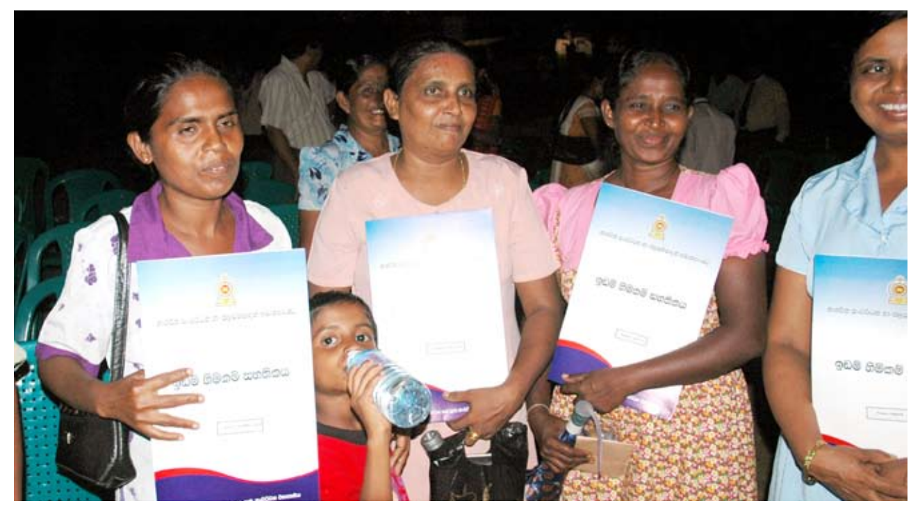
Proud of receiving an entitlement certificate.

Under the Lunawa Project, 88 households resettled in four sites. Out of these 88 households, 72 received the Entitlement Certificate, and the procedure for the remaining households is under process. Actions have been initiated to issue title deeds for these households.