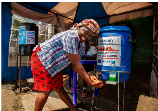
Left to Right: COVID-19 Prevention in Mathare, Nairobi, Kenya - May 2020.

Demand for medical supplies, such as personal protective equipment (PPE) and medical personnel in cities might also exacerbate the limited availability of PPE and medical personnel in rural areas and small towns and cities; these already often lack the same level of health service provision as cities.