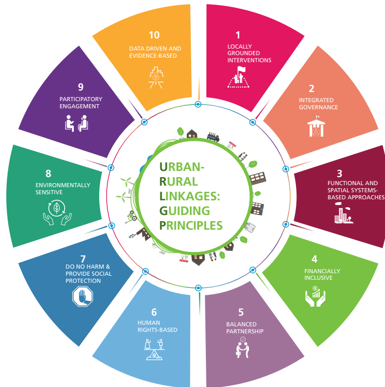
Fig1: Guiding Principles for Urban-Rural Linkages

While most principles are appropriate for the rehabilitation phase to come, four of the ten Guiding Principles seem to be especially relevant for the early emergency response phase.