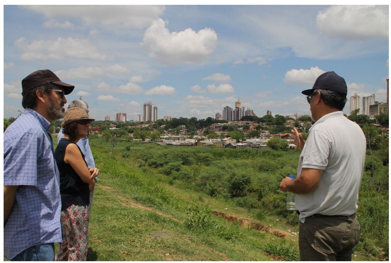
Field visit, Asuncion, Paraguay, 2019