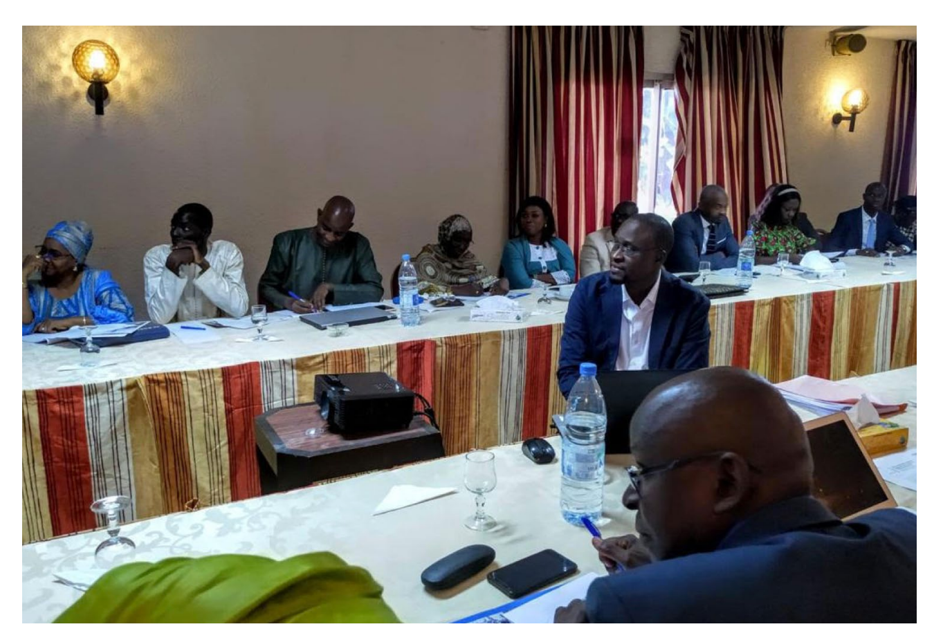
The CRPP Correspondent with the participants of the workshop on building resilience, Dakar, Senegal, 2019

of the intervention through its implementation. The intervention is well alligned with the 2030 Agenda for Sustainable Development, specifically Sustainable Devlopment Goals 11 Sustainable Cities and Communities, 13 Climate Action and 17 Partnership for the Goals.