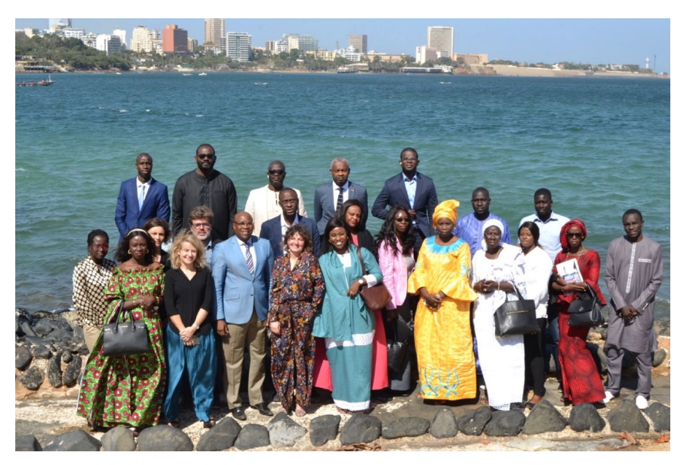
Local city authority representatives attending workshop on building resilience held in Dakar, Senegal, 2019