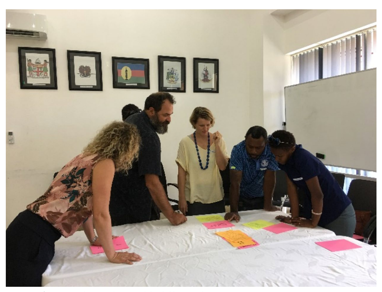
Discussion of participants during April 2019 Workshop held in Port Vila, Vanuatu.

Identify lessons learned and propose recommendation to scale-up or replication