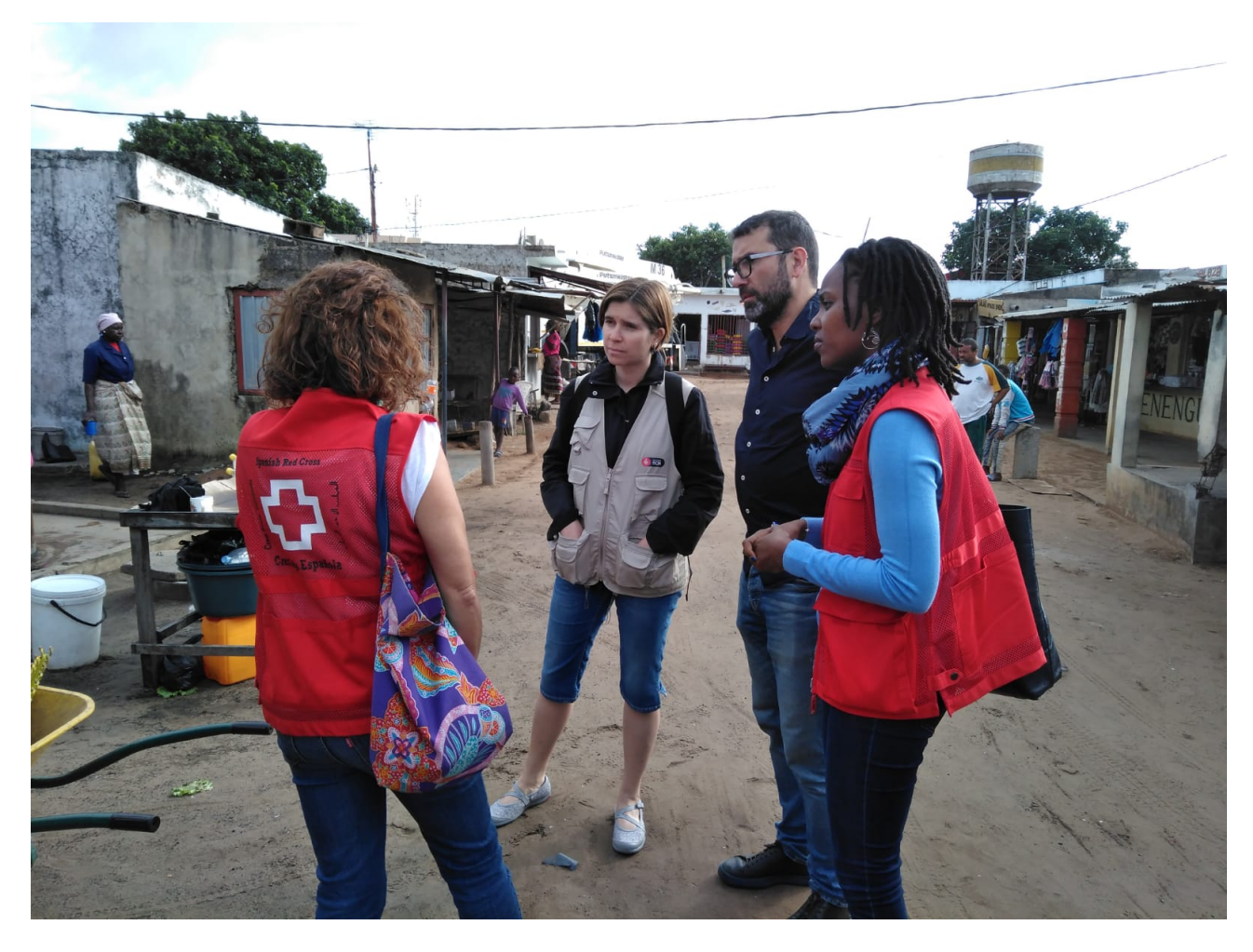
Field visit, Maputo, Mozambique, 2019

implementation of the CRGP methodology, and the need for translation into local languages of the entire project information, also affected the use of time and resources.