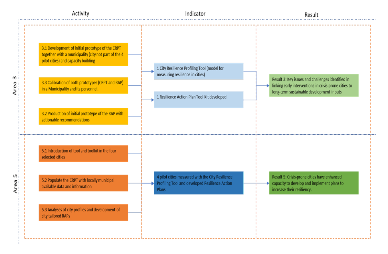
Figure 1: Result chain for the project

The project, consisting of two main components, Focus Area 3 & Focus Area 5 (Figure 1), ultimately aimed at increasing disaster risk reduction and resilience on cities both globally and locally. This was going to be achieved by the specific project results: