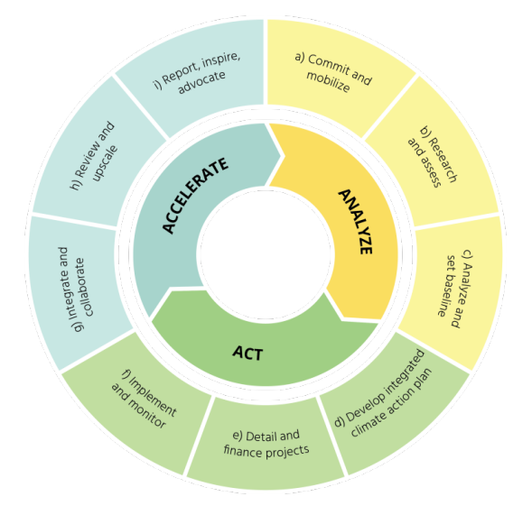
Figure 2: GreenClimateCities (GCC) process methodology

The intended results (IR) from the Description of the Action (the Project document , hereafter), linked to these objectives, are: