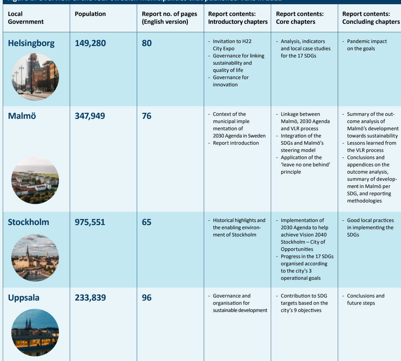
Figure 1. Overview of the four Swedish municipalities that published VLRs in 2021