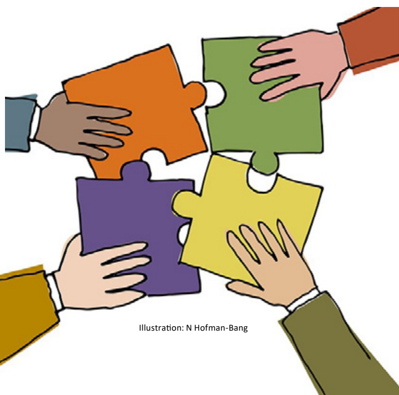
Illustration: N Hofman-Bang