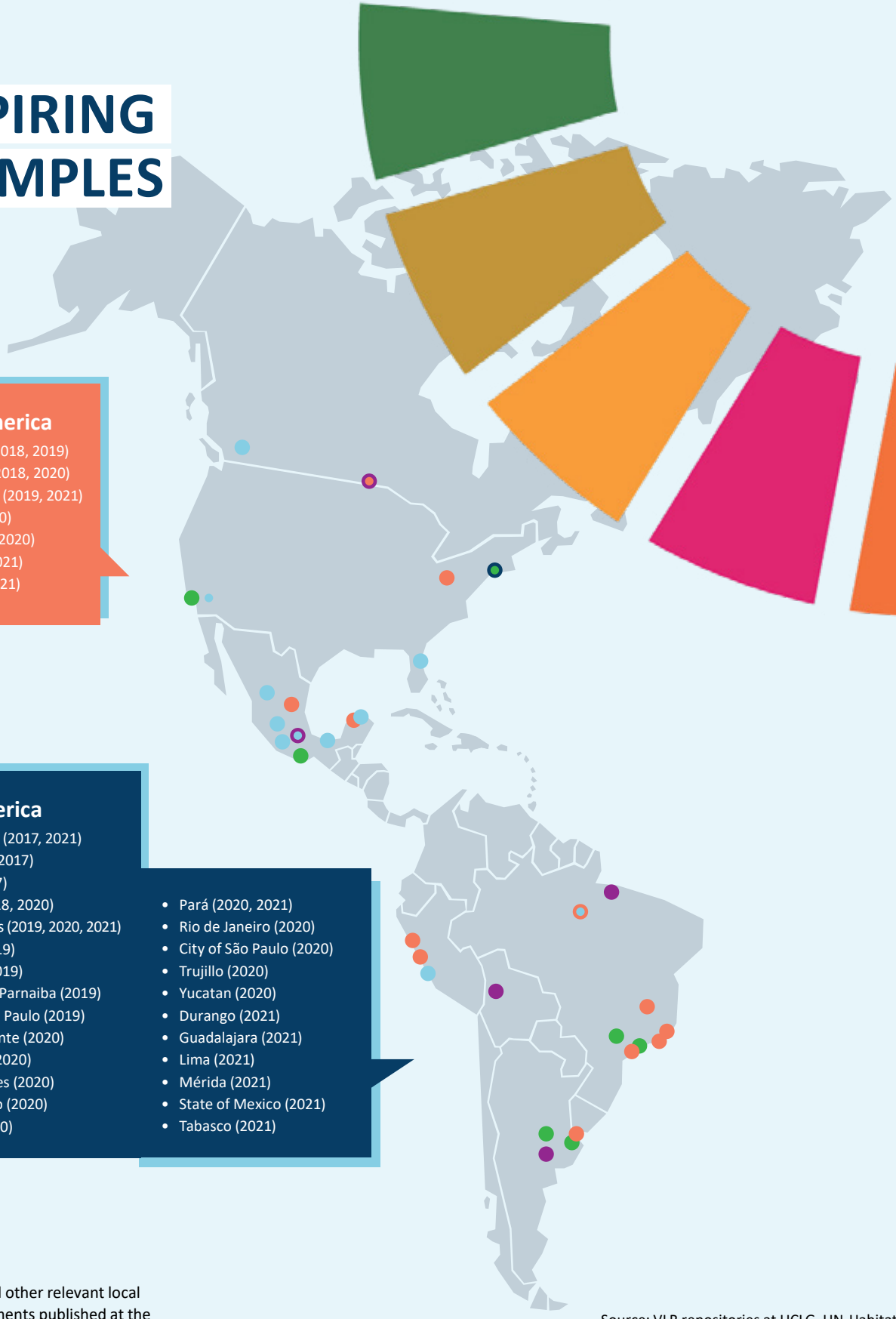
Figure 2. Map of VLRS and other relevant local reviewing documents published at the time of editing (November 2021)