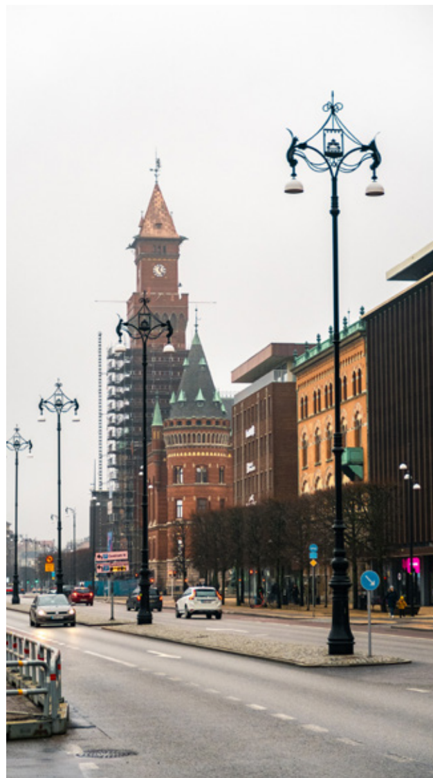
City of Helsingborg.

Local government associations play a fundamental role in raising local voices at the national level – this is especially because they are often crucial institutional gatekeepers that can convey the interests of medium- and small-sized cities, which are of paramount importance in global urbanisation.