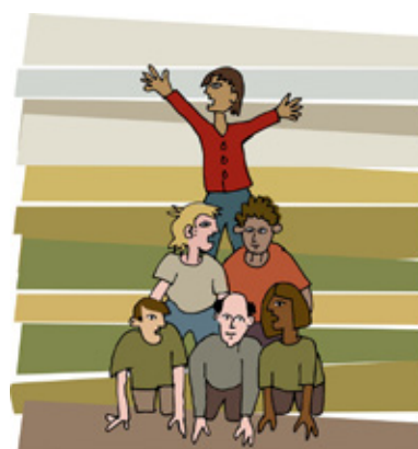
Illustration: N. Hofman-Bang