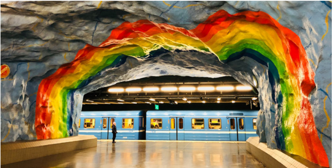
Subway Stockholm.