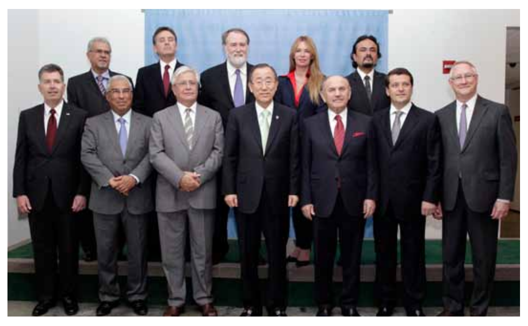
Secretary-General Ban Ki-moon (front, centre) and Executive Director, UN-Habitat, Joan Clos with mayors and regional authorities on sustainable development and the UN Rio+20 Conference at United Nations Headquarters in New York. The meeting was organized by UN-Habitat, 2012

port partnerships such as the Earth Institute at Columbia University and feeds directly into projects on land, legislation and governance, as well as research and capacitybuilding projects.