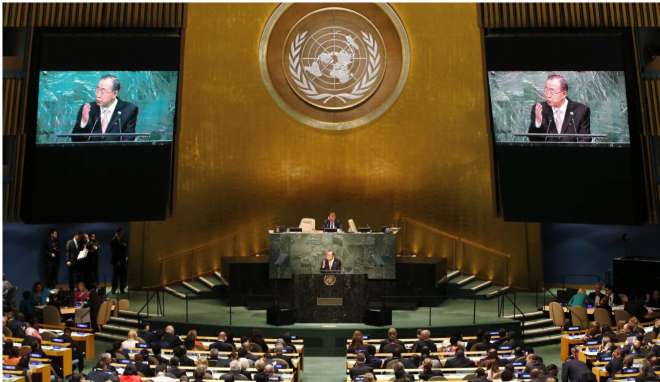
U.N. Secretary-General Ban Ki-moon addresses a plenary meeting of the United Nations.