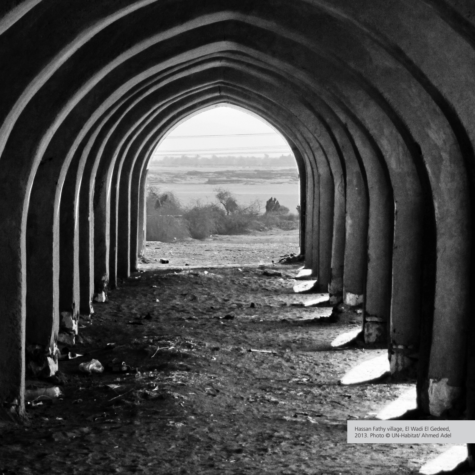
Hassan Fathy village, El Wadi El Gedeed, 2013.