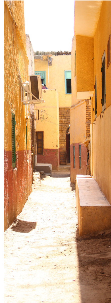
Nubia, Aswan, 2012.