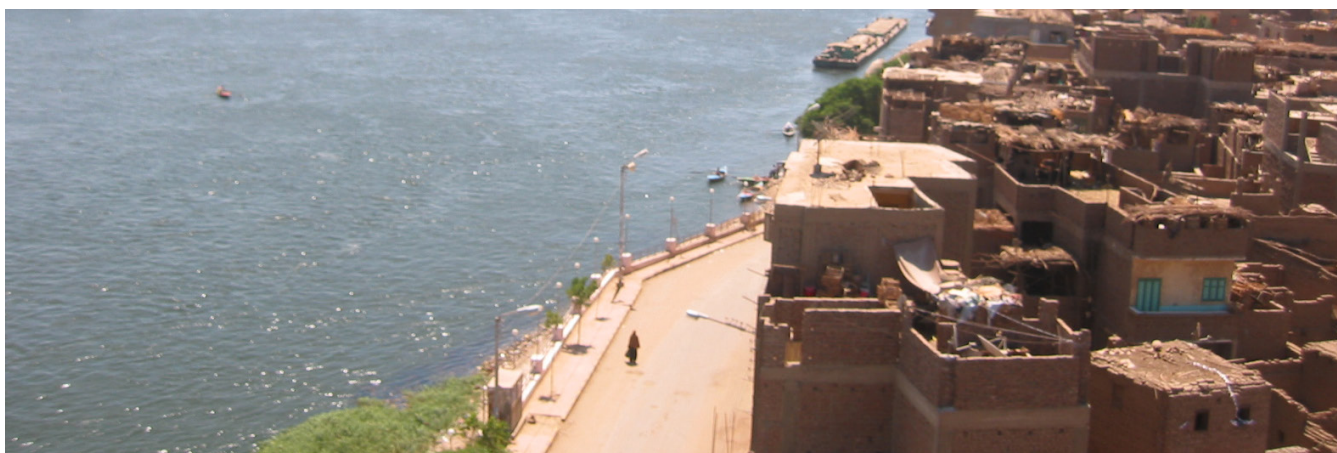
El Maragha small city, Souhag, 2009.

by the demographic explosion. Despite the governments' efforts to make the irrigation system in the Nile Valley and in the Delta more efficient during the last century, the demographic growth and its urban expansion is currently the biggest threat for the natural resources of the country. In fact, water pollution and poor sewage treatment is partly responsible for a high infant mortality throughout the country. 7 In terms of energy, Egypt still has a strong oil and gas dependency -96% of its primary energetic needs- which has provoked the appearance of other environmental issues in the last 50 years, such as solid waste management and air pollution. 8