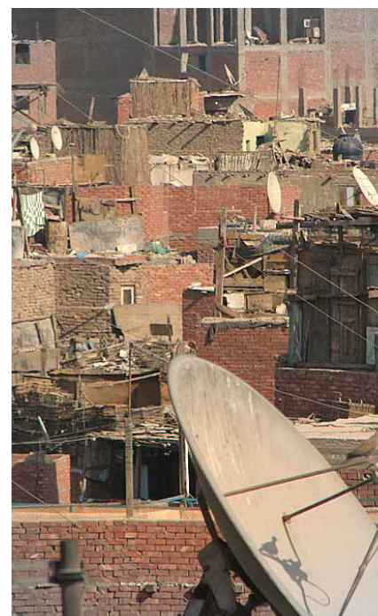
Informal areas 2014.

As informal areas continue to rapidly grow in Egypt, UN-Habitat is growing its urban upgrading portfolio through testing tools and methodologies that can be scaled up to the national scale. To respond to existing needs, UN-Habitat is focusing on basic infrastructure while providing institutional support. The overarching goal for this portfolio is to develop a toolkit of processes that the relevant government counterpart can roll out at the national scale.