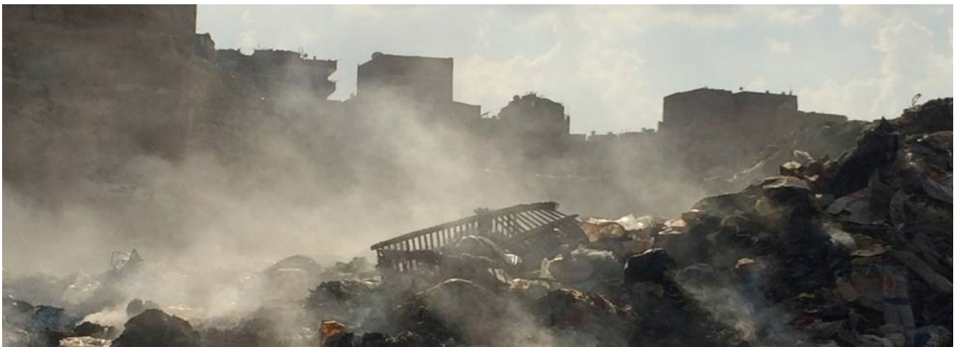
Manshiet Nasser, 2014.

The project aimed to ensure that the urbanization process can be achieved in a controlled and sustainable manner, and that the expected socio-economic benefits derived from this process translate into an equitable and efficient urban settlement patterns. The key accomplishments expected were (1) improved national awareness on planning cities expansion; (2) improved planning, implementation and monitoring practices in cities extension; (3) systematized knowledge for enhanced management of urban growth in Egypt; and (4) improved regional knowledge on detailed planning for city densification and extension.