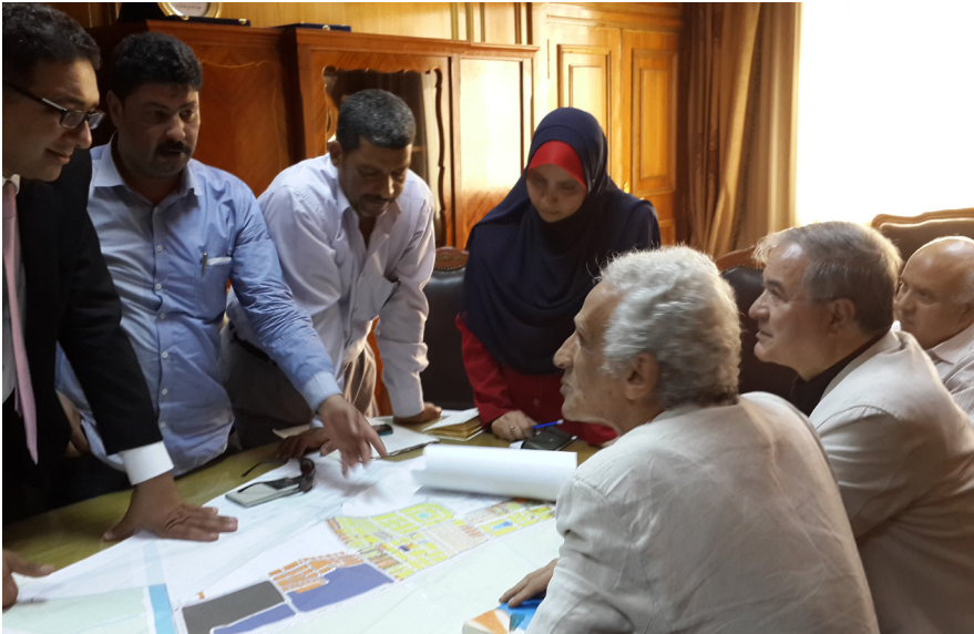
Stakeholders meeting on land readjustment proposal in Banha, 2014.

a Bus Rapid Transit system and the subsequent promotion of greater non-motorized transport infrastructure in Cairo. The concept aims to integrate various existing transport infrastructure – namely, the Metro system and the Cairo Transport Authority Bus Lines – with low-cost, low-infrastructure systems, in order to reduce traffic congestion.