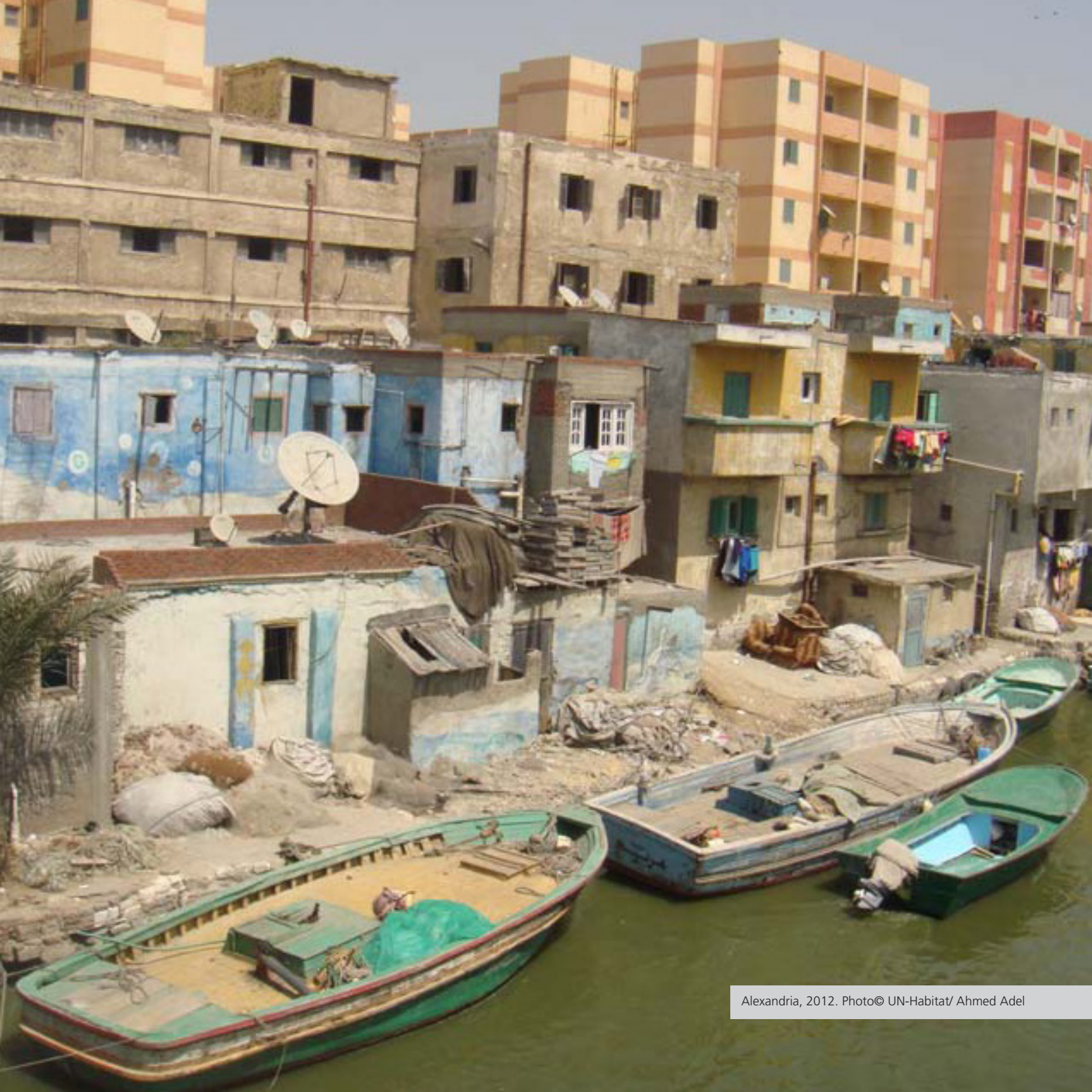
Alexandria, 2012.