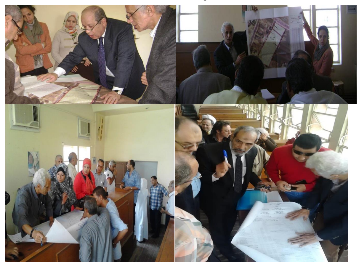
Photo 1: Photos from the consultation meetings with landowners in Banha