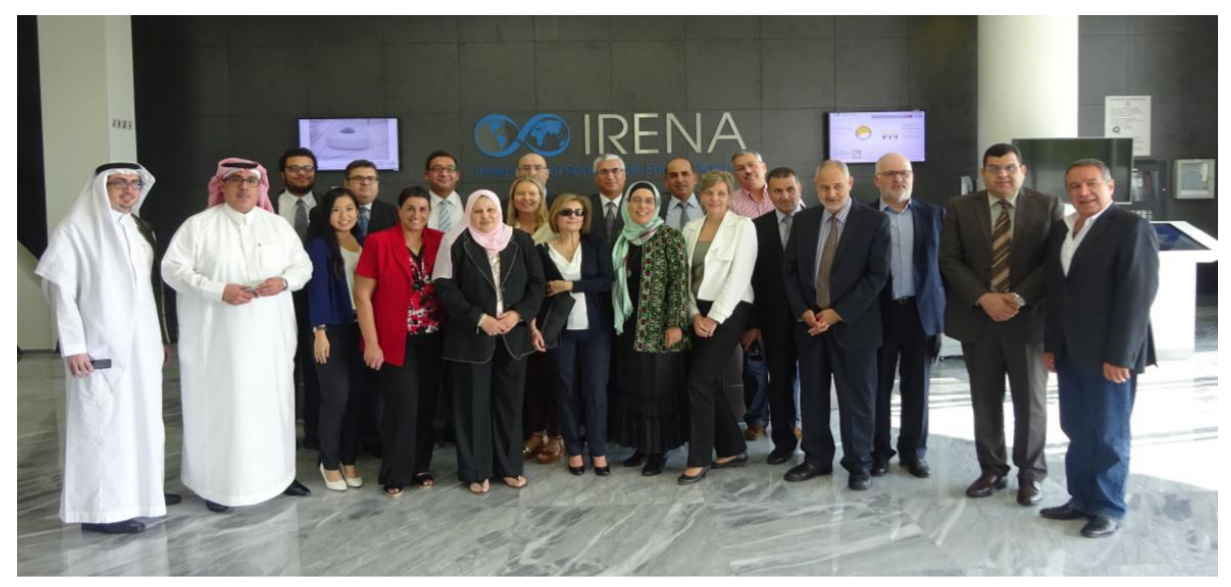
Photo 3: Group photo of the participants in the Regional Expert Meeting

Under outcome 4 , one Regional Expert Group Meeting on Urban Planning Laws in Arab States was organised in Abu Dhabi on 19-20th October 2015 with the participation of experts from the stakeholders and the countries of the region stakeholders.