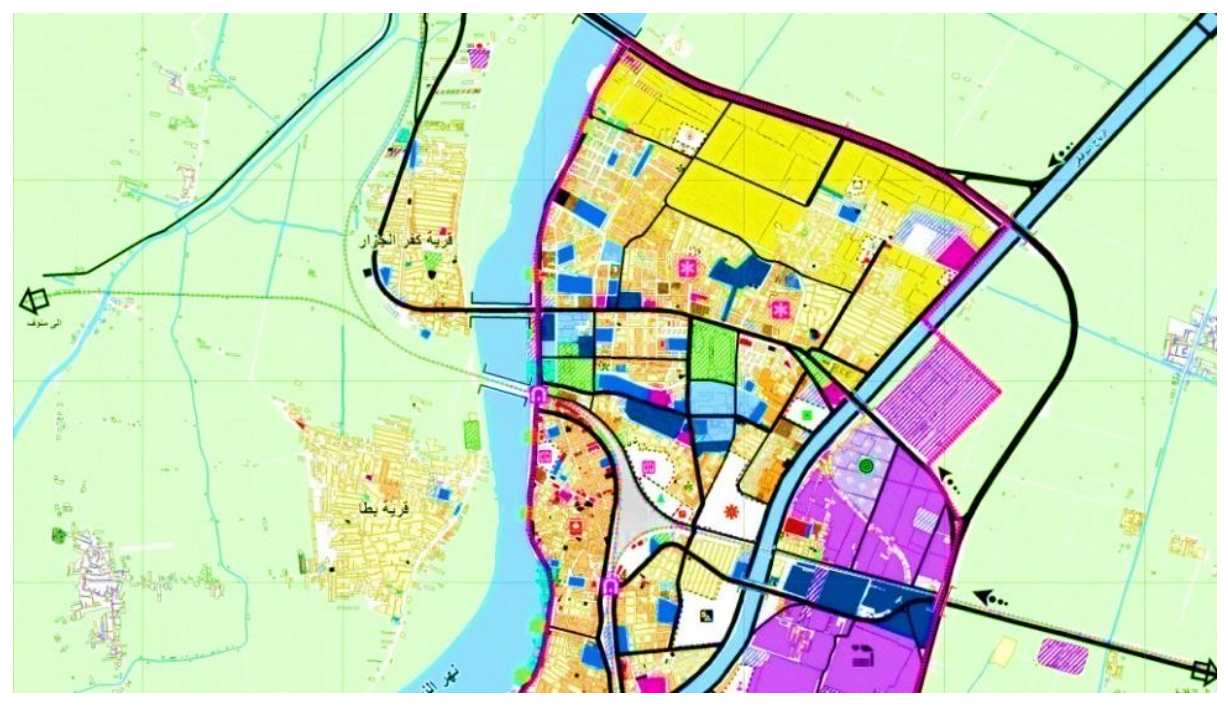
Map 1: Strategic plan of the Northern part of Banha, extension areas in yellow.