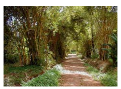
Entebbe Botanical Gardens, Uganda

Entebbe is home of the Entebbe Wildlife Educational Center. which showcases Uganda's wildlife, especially chimpanzees and birds, as well as the Entebbe Botanical Gardens - a tropical paradise of Ugandan plant life. These beautifully landscaped gardens developed natural forest have a collection of 309 species, of which 199 are indigenous to Uganda, 122