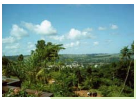
Aerial view of Bukob<mark>a Town, Tanzania</mark>

In Bukoba, mineral resources such as rocks and sand are available and are extracted by local medium- and small-scale miners. Other sectors also depend on these mineral resources for construction activities, resulting in land degradation and the disruption of biodiversity.