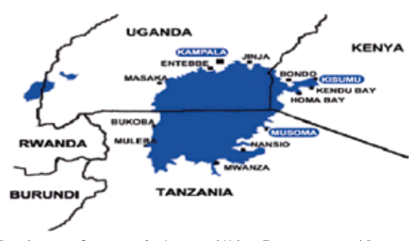
Figure I: The Region and Project Sites: Musoma, Kisumu and Kampala