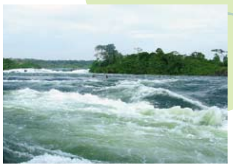
Bujagali Falls, Jinja Uganda

In Jinja the Municipal Council, with support from the French Embassy, has established an Environmental Pedagogic Centre (EPC) to stimulate environmental awareness and support behaviour change amongst the community.