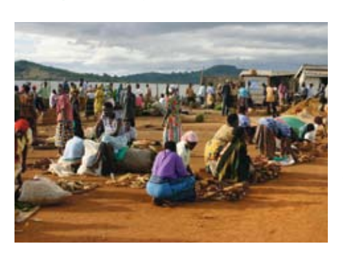
Ggaba beach, Kampala Uganda.

Kampala's wetlands have been greatly degraded due to the location of the capital district in an area that combines high population densities with commercial and industrial development. The size and biodiversity of unconverted portions of the wetlands have drastically diminished. with some areas completely converted. Housing. industrialization