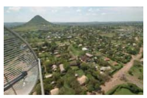
Aerial view of Homabay Town

water supply sources, extending water supplies to the poor and constructing sanitation facilities. These facilities include supply and installation solid waste handling equipment, rehabilitation of treatment works, construction of public water kiosks and integrated sanitation facilities at schools.